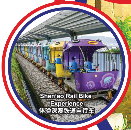
Shen'ao Rail Bike Experience 体验深澳铁道自行车

行程次序，以当地旅社安排为准。 Sequences of Itinerary are subject to local arrangement.