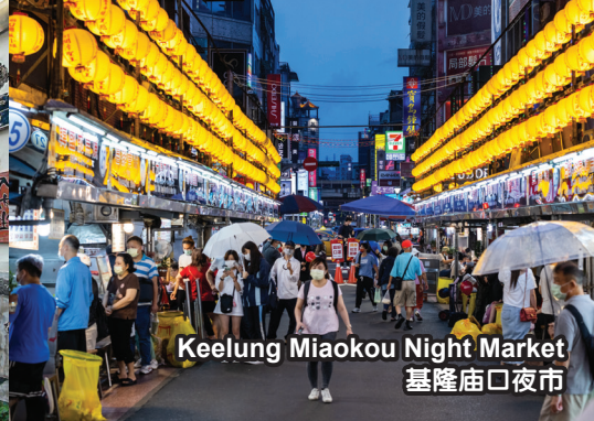
Keelung Miaokou Night Market 基隆庙口夜市