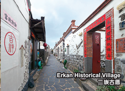
Erkan Historical Village 二炭古厝