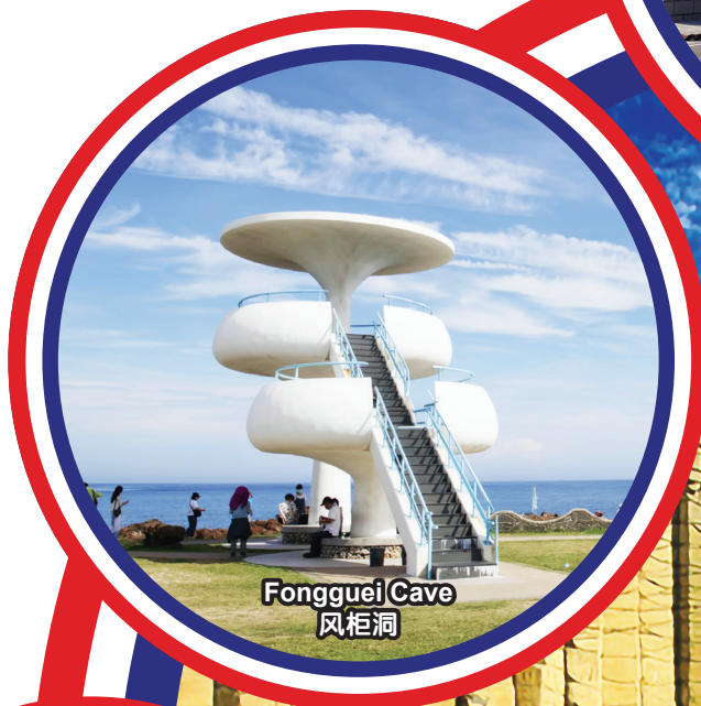
Fongguei Cave 风柜洞