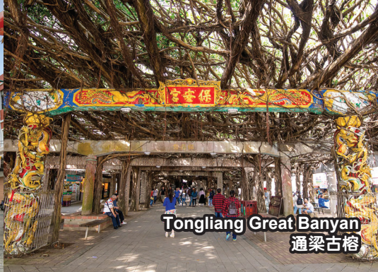
Tongliang Great Banyan 通梁古榕