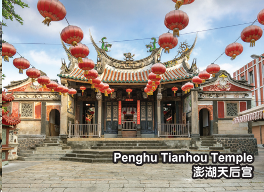
Penghu Tianhou Temple 澎湖天后宫