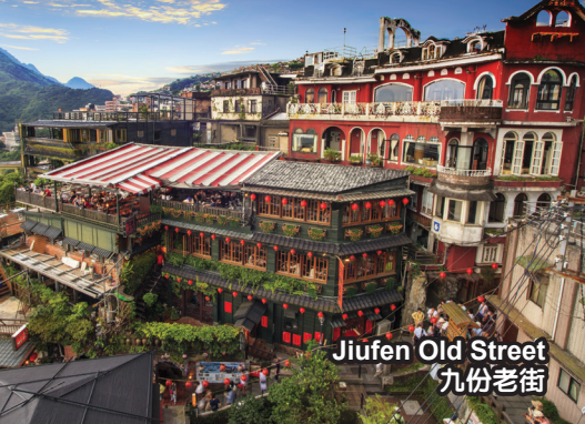
Jiufen Old Street 九份老街