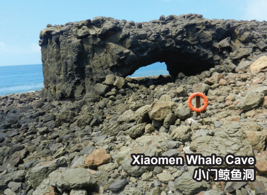
Xiaomen Whale Cave 小门鲸鱼洞