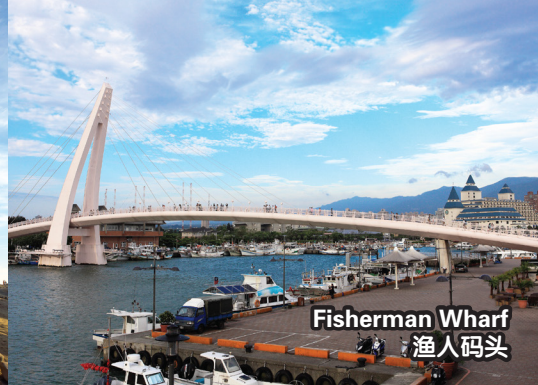
Fisherman Wharf 渔人码头