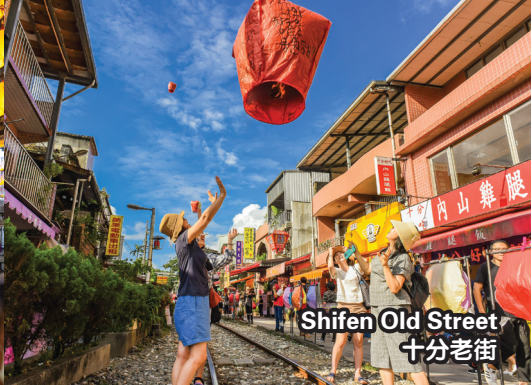
Shifen Old Street 十分老街