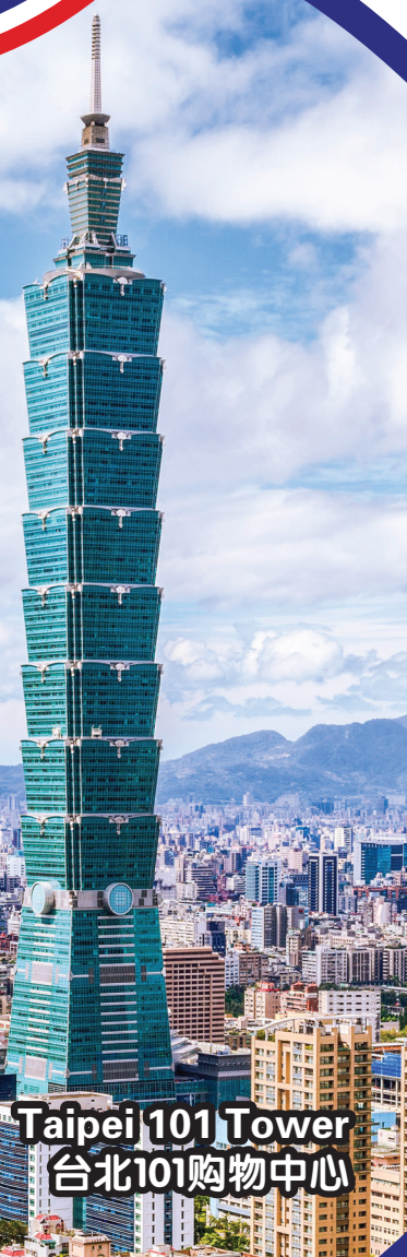
Taipei 101 Tower 台北101购物中心

行程次序，以当地旅社安排为准。 Sequences of Itinerary are subject to local arrangement.