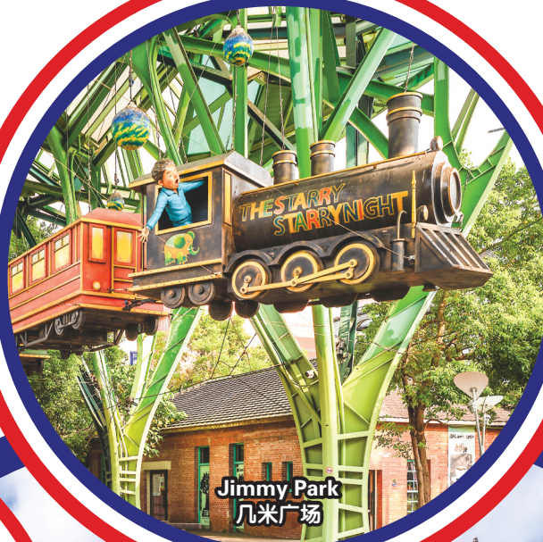
Jimmy Park 几米广场