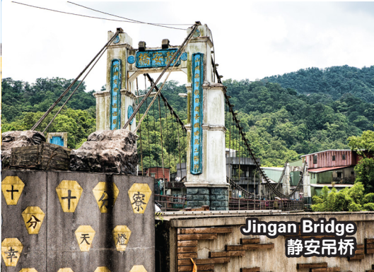
Jingan Bridge 静安吊桥