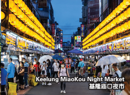
Keelung MiaoKou Night Market 基隆庙口夜市