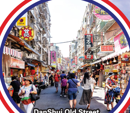
DanShui Old Street 淡水老街

行程次序，以当地旅社安排为准。 Sequences of Itinerary are subject to local arrangement.