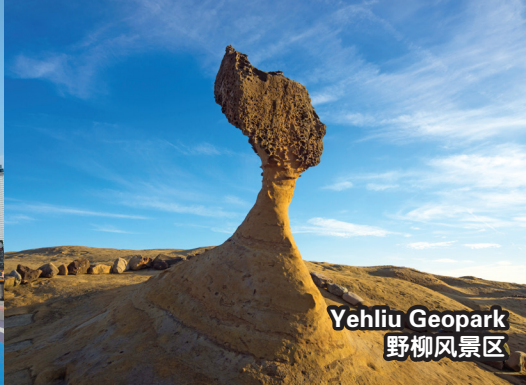
Yehliu Geopark 野柳风景区