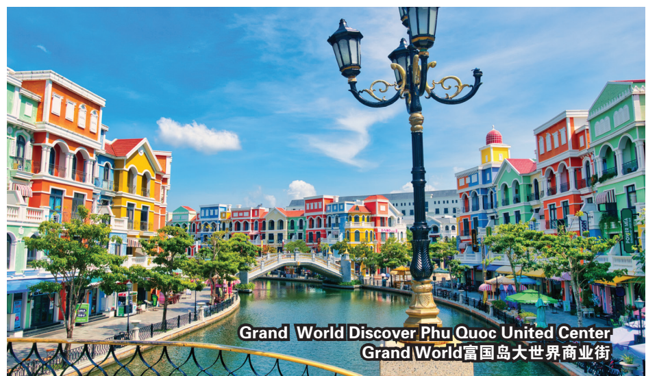
Grand World Discover Phu Quoc United Center Grand World富国岛大世界商业街

Disclaimer: Due to Covid-19 travel restrictions, local / religious festivals, public holidays, weather condition, transport technical issue, acts of nature, Golden Destinations reserved the right to alter the sequence or change, amend or alter the itinerary if necessary, with or without prior notice.