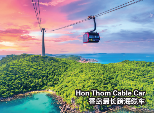
Hon Thom Cable Car 香岛最长跨海缆车