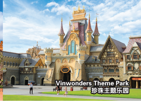
Vinwonders Theme Park 珍珠主题乐园