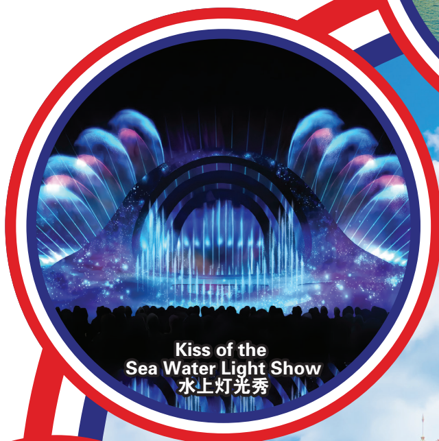
Kiss of the Sea Water Light Show 水上灯光秀