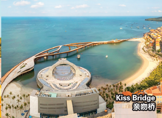
Kiss Bridge 亲吻桥