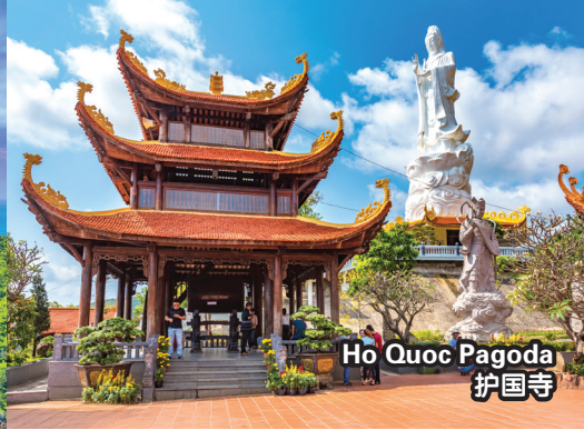
Ho Quoc Pagoda 护国寺