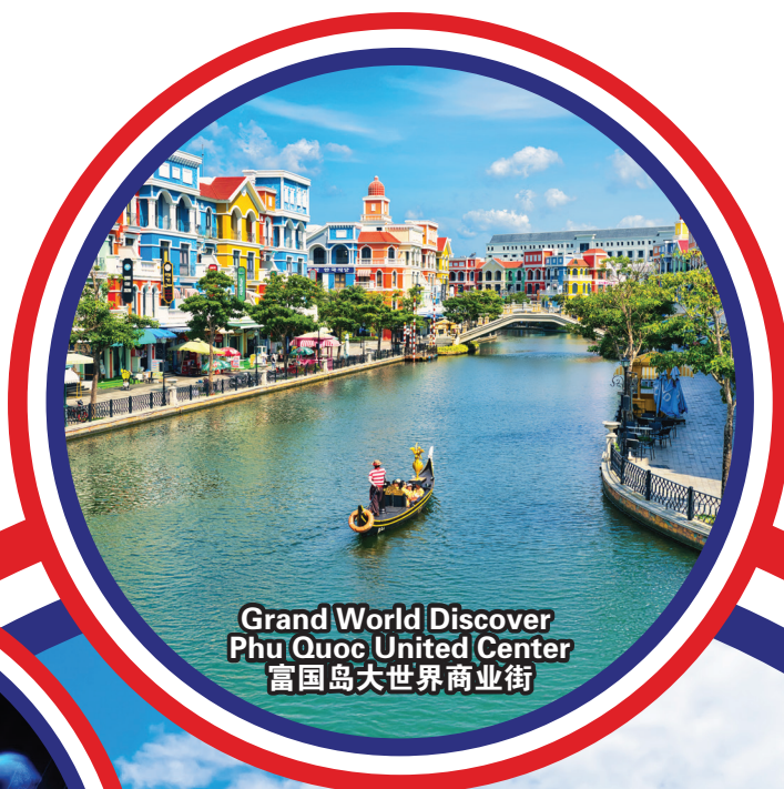
Grand World Discover Phu Quoc United Center 富国岛大世界商业街