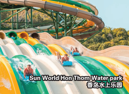
Sun World Hon Thom Water park 香岛水上乐园