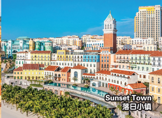
Sunset Town 落日小镇