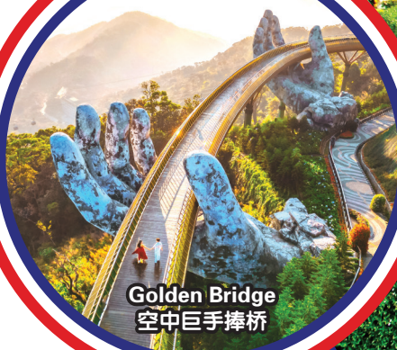
Golden Bridge 空中巨手捧桥