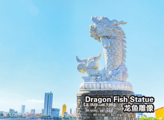
Dragon Fish Statue 龙鱼雕像 DA NANG - VIETNAM