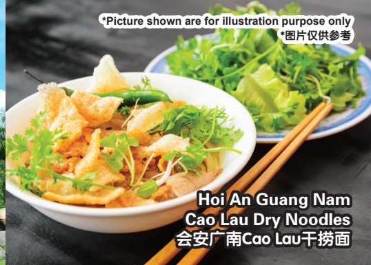
Hoi An Guang Nam Cao Lau Dry Noodles 会安广南Cao Lau干捞面

*Picture shown are for illustration purpose only *图片仅供参考