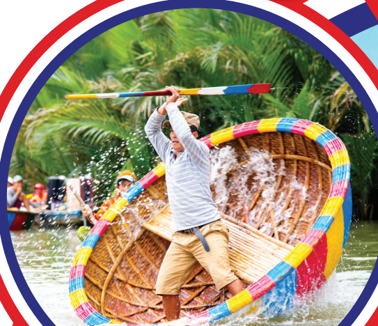
Cam Thanh Coconut Village Cam Thanh 椰子村