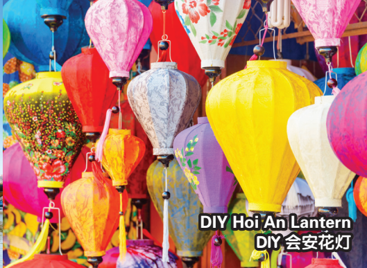
DIY Hoi An Lantern DIY 会安花灯