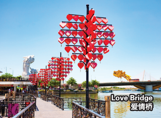
Love Bridge 爱情桥