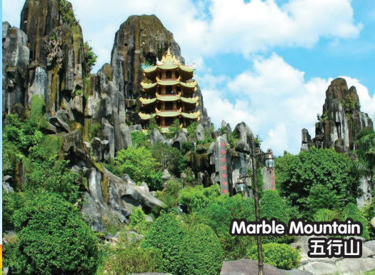
Marble Mountain 五行山