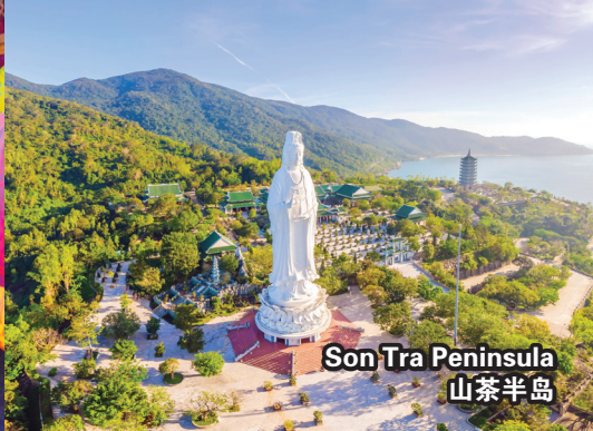
Son Tra Peninsula 山茶半岛