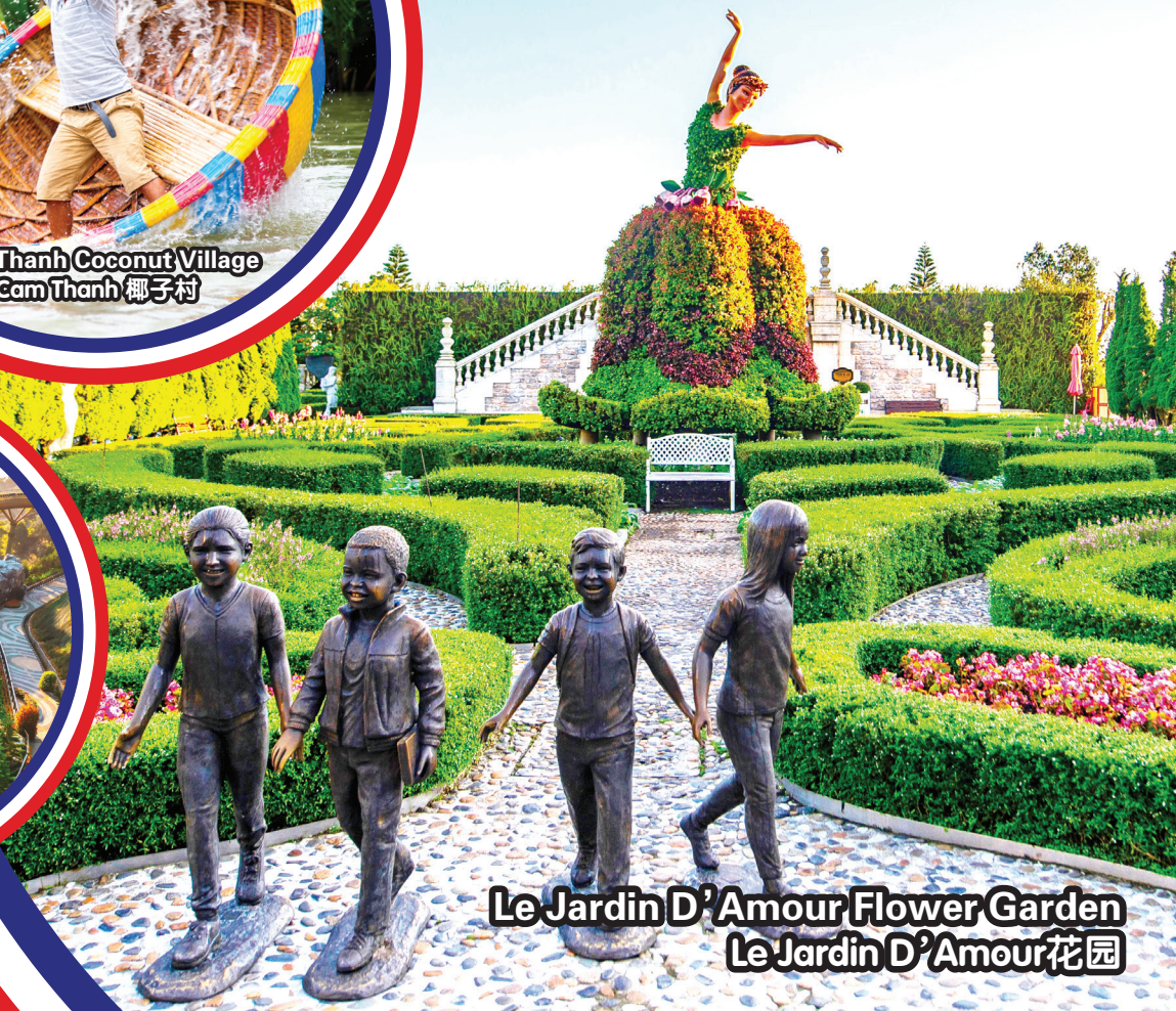
Le Jardin D'Amour Flower Garden Le Jardin D'Amour花园

行程次序, 以当地旅社安排为准。 Sequences of Itinerary are subject to local arrangement.