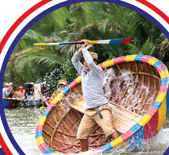
Cam Thanh Coconut Village Cam Thanh 椰子村