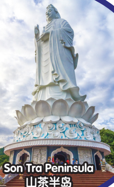
Son Tra Peninsula 山茶半岛