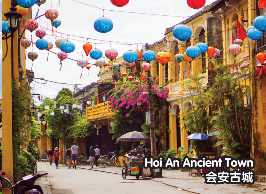
Hoi An Ancient Town 会安古城