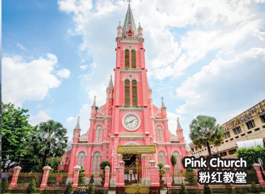
Pink Church 粉红教堂