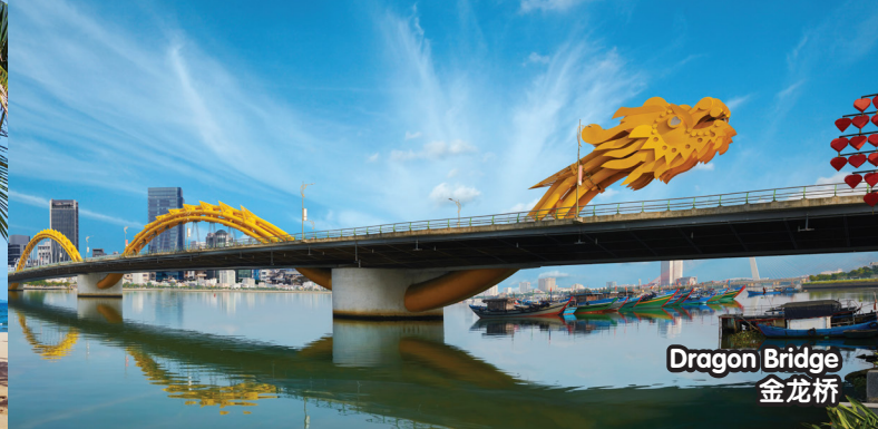
Dragon Bridge 金龙桥