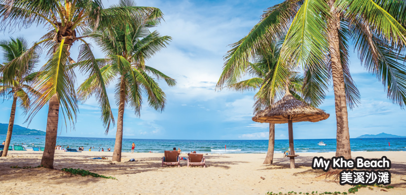
My Khe Beach 美溪沙滩