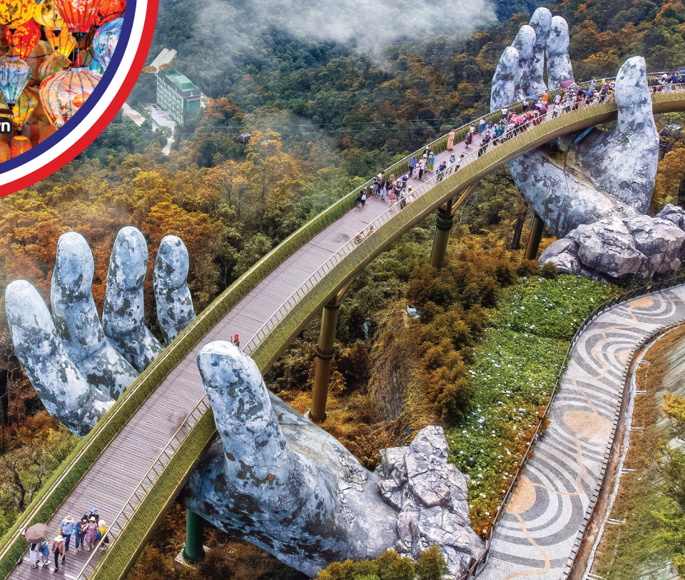
Golden Bridge 空中巨手桥