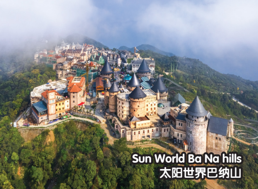
Sun World Ba Na hills 太阳世界巴纳山