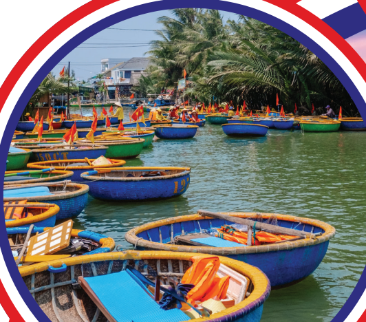
Cam Thanh Coconut Village Cam Thanh 椰子村