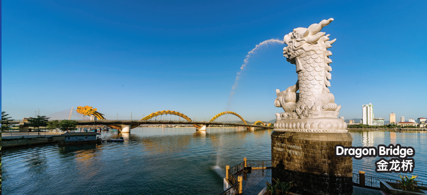
Dragon Bridge 金龙桥