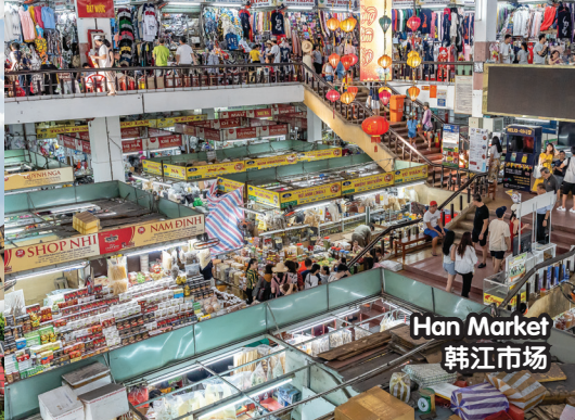
Han Market 韩江市场