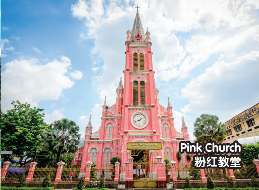
Pink Church 粉红教堂