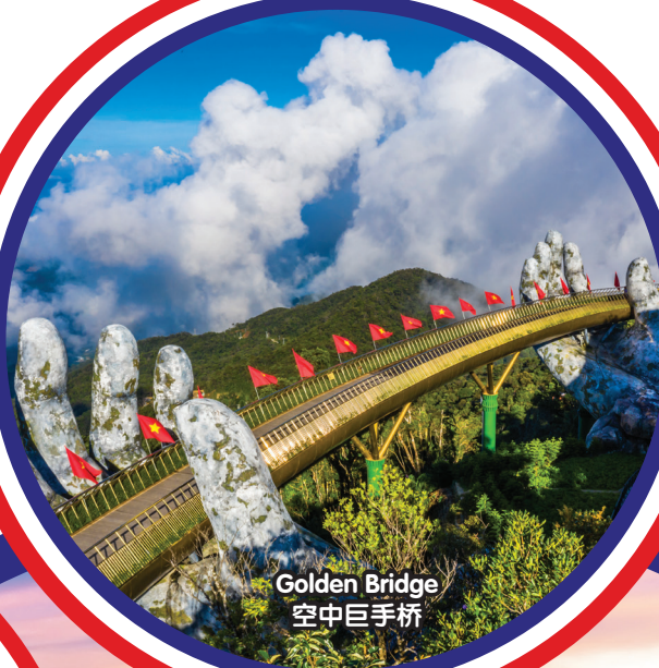
Golden Bridge 空中巨手桥