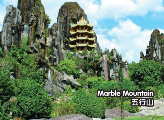
Marble Mountain 五行山