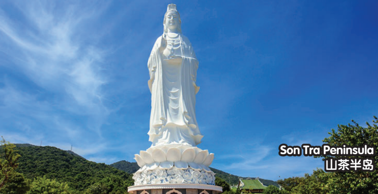
Son Tra Peninsula 山茶半岛