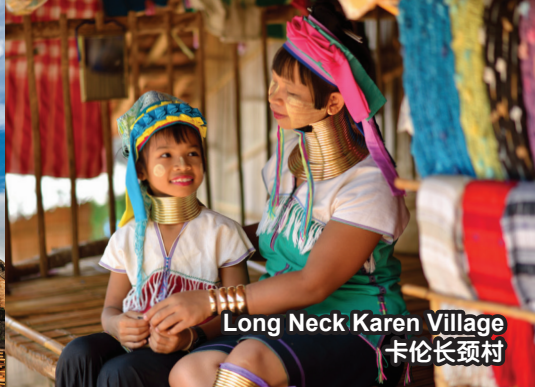
Long Neck Karen Village 卡伦长颈村