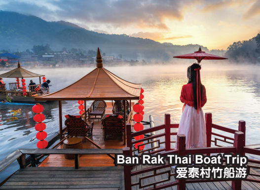
Ban Rak Thai Boat Trip 爱泰村竹船游