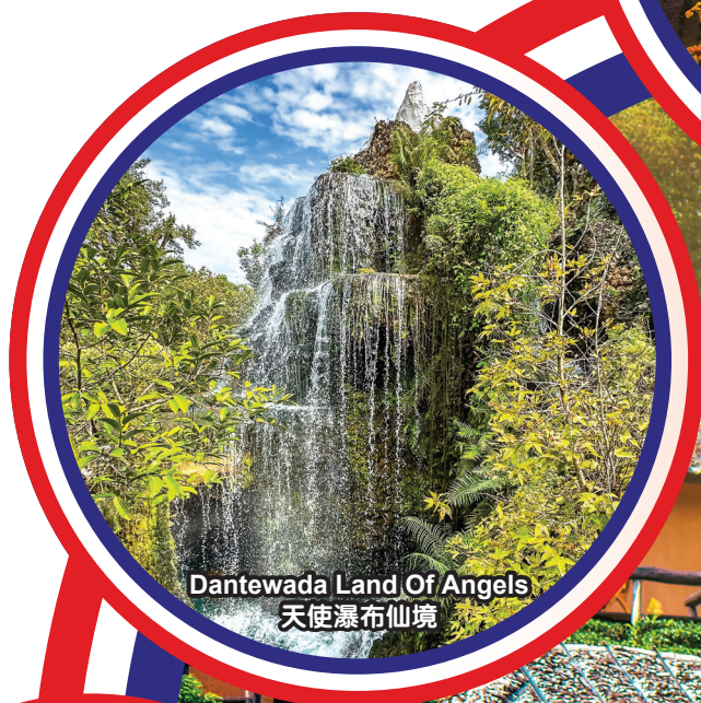
Dantewada Land Of Angels 天使瀑布仙境