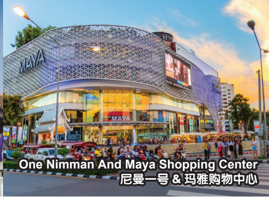
One Nimman And Maya Shopping Center 尼曼一号 & 玛雅购物中心