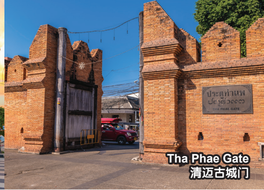
Tha Phae Gate 清迈古城门