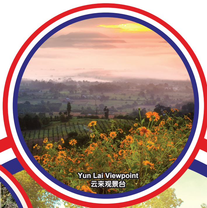
Yun Lai Viewpoint 云来观景台