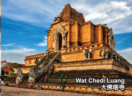
Wat Chedi Luang 大佛塔寺