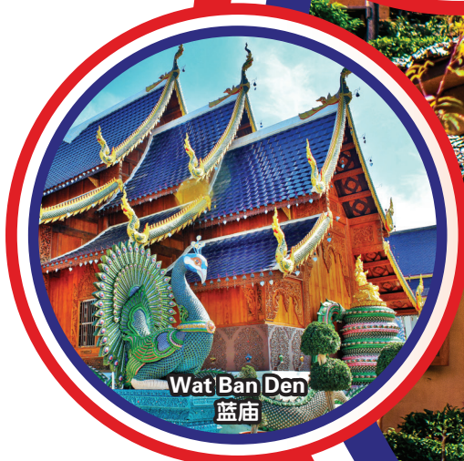
Wat Ban Den 蓝庙