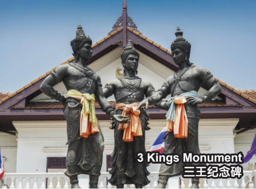
3 Kings Monument 三王纪念碑