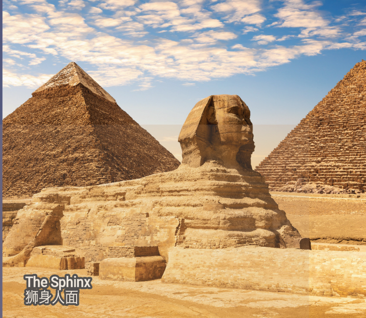
The Sphinx 狮身人面