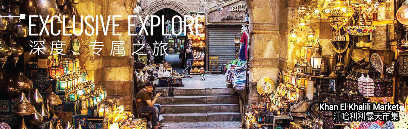
Khan El Khalili Market 汗哈利利露天市集