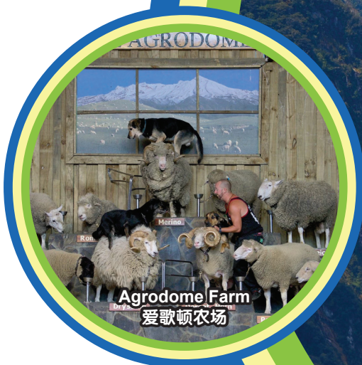
Agrodome Farm 爱歌顿农场