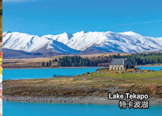
Lake Tekapo 特卡波湖