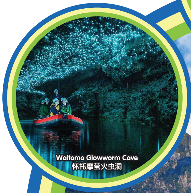
Waitomo Glowworm Cave 怀托摩萤火虫洞