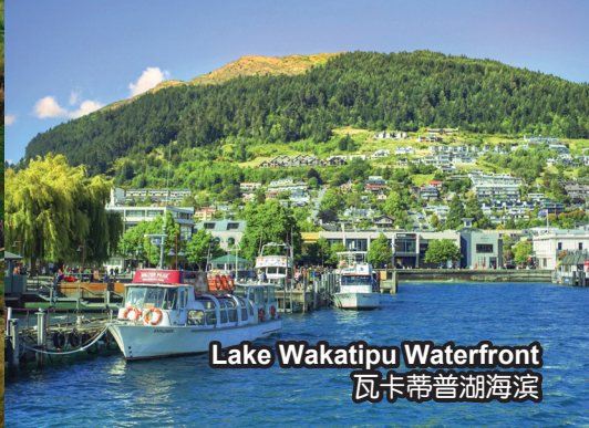
Lake Wakatipu Waterfront 瓦卡蒂普湖海滨