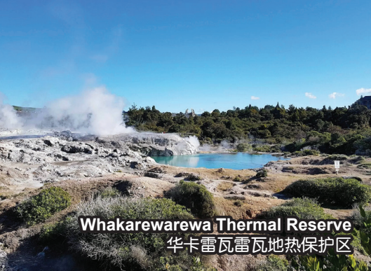
Whakarewarewa Thermal Reserve 华卡雷瓦雷瓦地热保护区