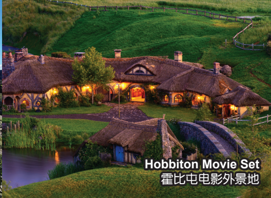
Hobbiton Movie Set 霍比屯电影外景地