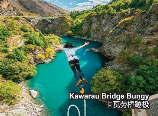
Kawarau Bridge Bungy 卡瓦劳桥蹦极