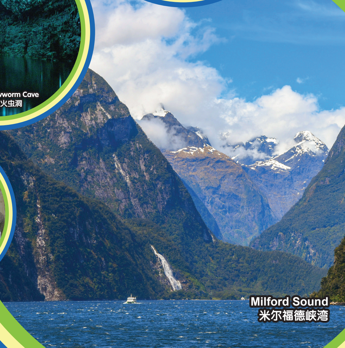
Milford Sound 米尔福德峡湾

行程次序，以当地旅社安排为准。 Sequences of Itinerary are subject to local arrangement.