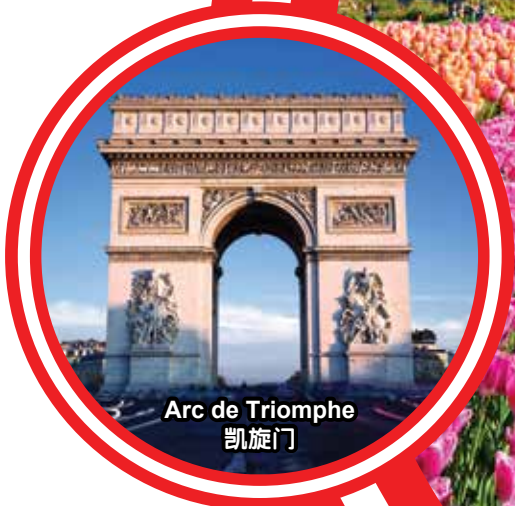
Arc de Triomphe 凯旋门

行程次序，以當地旅社安排為準。 Sequences of Itinerary are subject to local arrangement.