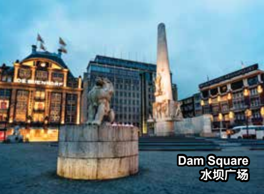
Dam Square 水坝广场