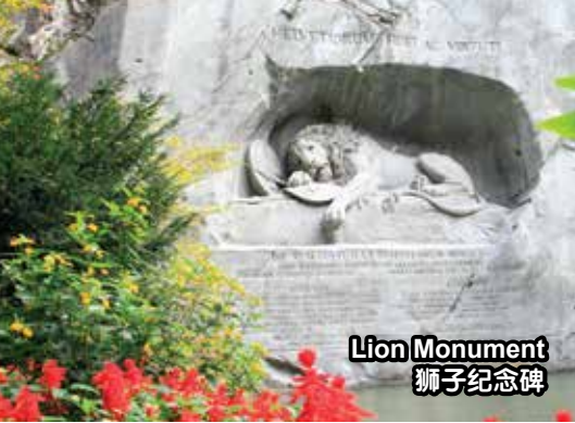
Lion Monument 狮子纪念碑