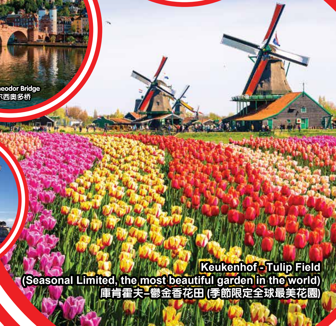
Keukenhof - Tulip Field (Seasonal Limited, the most beautiful garden in the world) 庫肯霍夫-鬱金香花田 (季節限定全球最美花園)

行程次序，以當地旅社安排為準。 Sequences of Itinerary are subject to local arrangement.