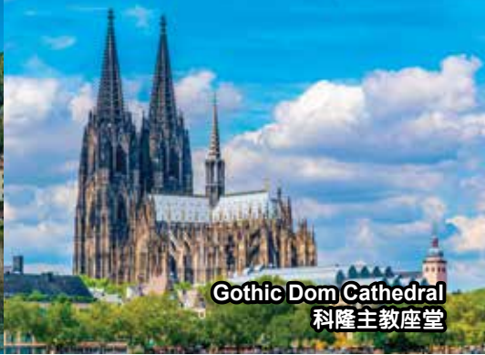
Gothic Dom Cathedral 科隆主教座堂