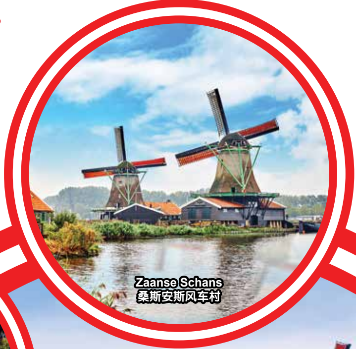
Zaanse Schans 桑斯安斯风车村