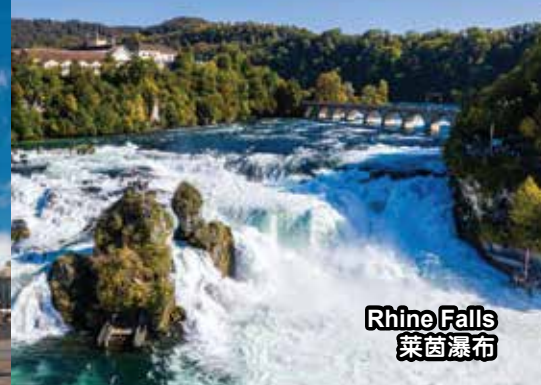
Rhine Falls 莱茵瀑布