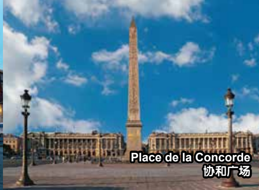
Place de la Concorde 协和广场