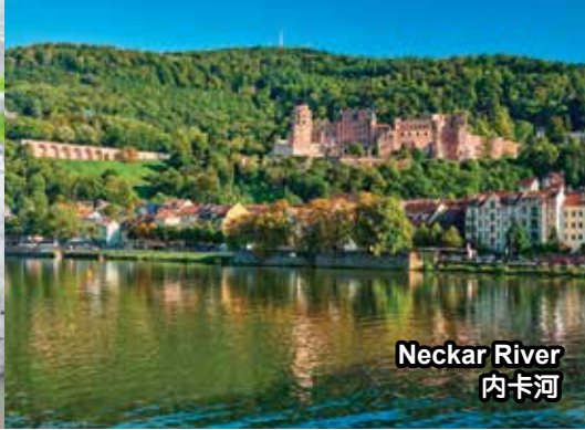
Neckar River 内卡河