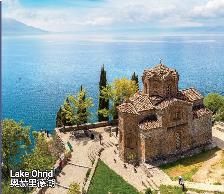
Lake Ohrid 奥赫里德湖