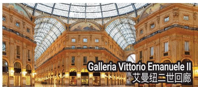
Galleria Vittorio Emanuele II 艾曼纽二世回廊