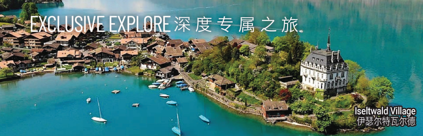
Iseltwald Village 伊瑟尔特瓦尔德