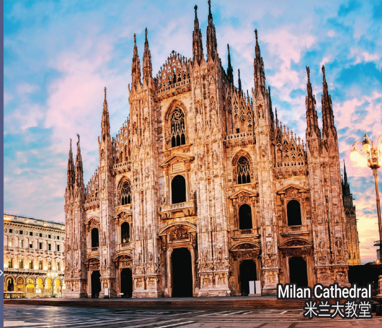
Milan Cathedral 米兰大教堂