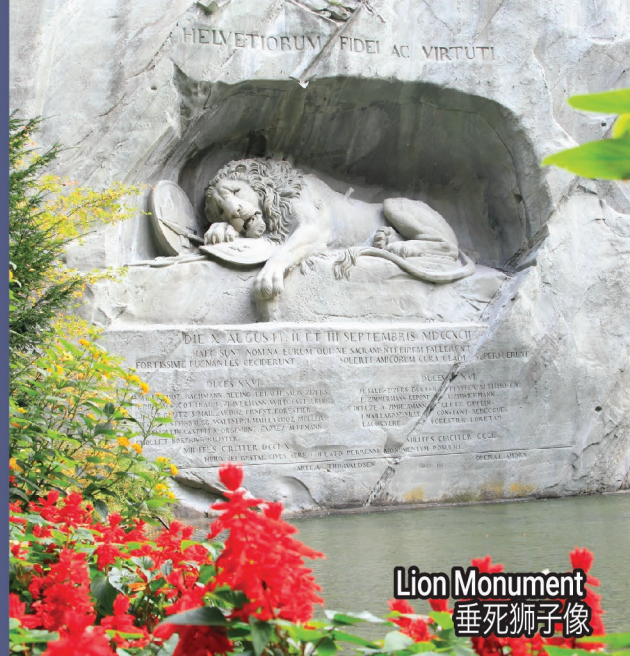
Lion Monument 垂死狮子像