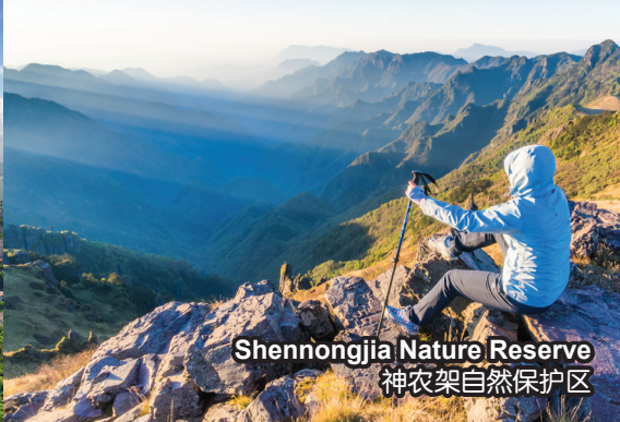
Shennongjia Nature Reserve 神农架自然保护区