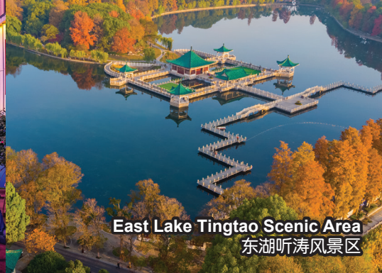
East Lake Tingtao Scenic Area 东湖听涛风景区