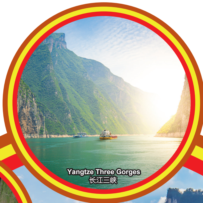
Yangtze Three Gorges 长江三峡