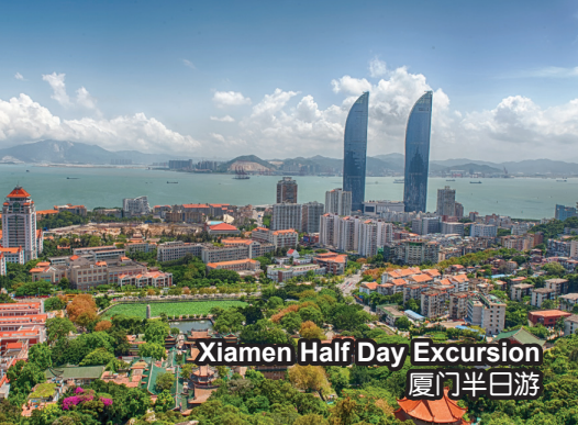
Xiamen Half Day Excursion 厦门半日游