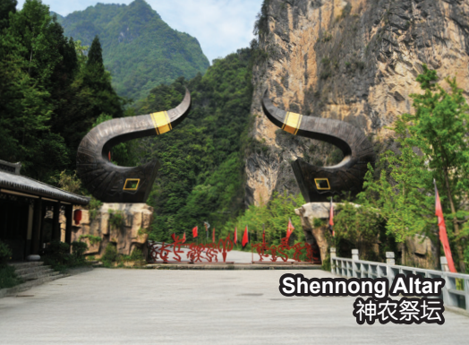
Shennong Altar 神农祭坛