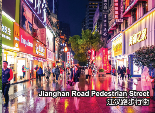
Jiangnan Road Pedestrian Street 江汉路步行街