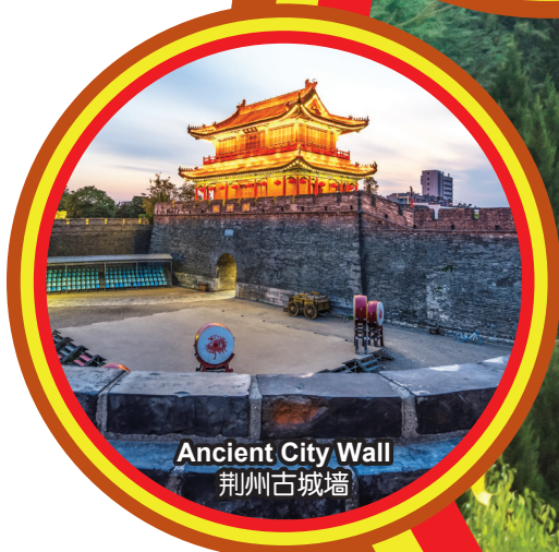
Ancient City Wall 荆州古城墙