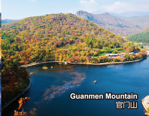
Guanmen Mountain 官门山