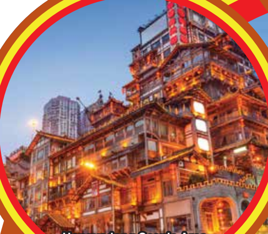
Hongyadong Scenic Area 洪崖洞风景区