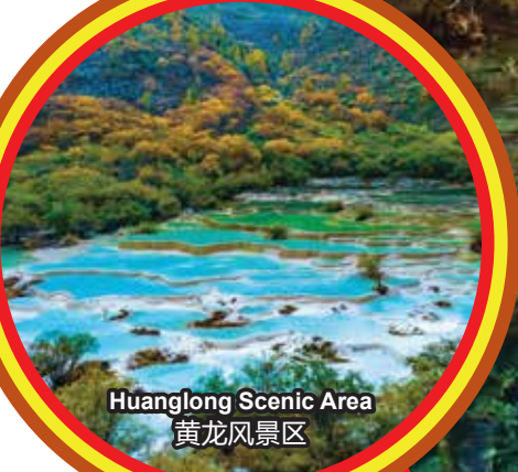
Huanglong Scenic Area 黄龙风景区