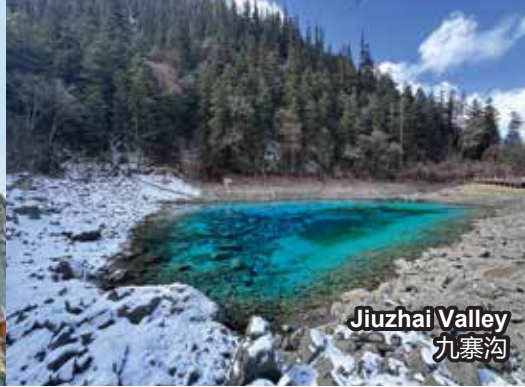
Jiuzhai Valley 九寨沟