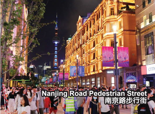
Nanjing Road Pedestrian Street 南京路步行街