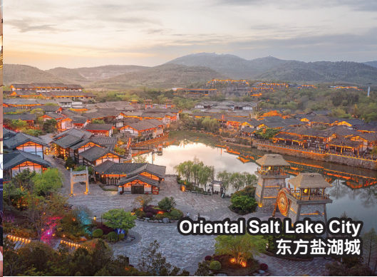
Oriental Salt Lake City 东方盐湖城