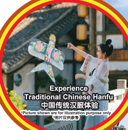
Experience Traditional Chinese Hanfu 中国传统汉服体验

*Picture shown are for illustration purpose only *图片仅供参考