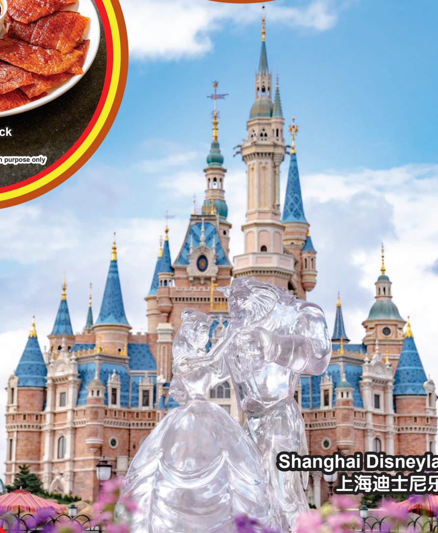
Shanghai Disneyland 上海迪士尼乐园

*Picture shown are for illustration purpose only *图片仅供参考