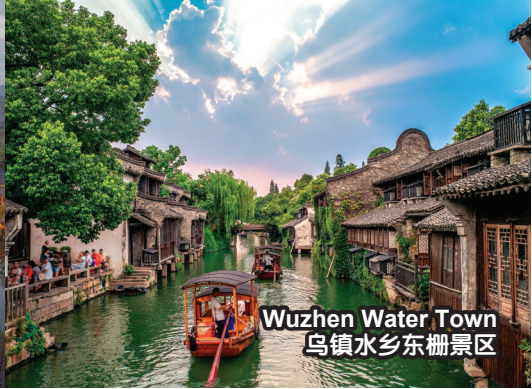
Wuzhen Water Town 乌镇水乡东栅景区