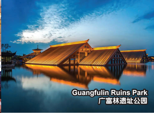
Guangfulin Ruins Park 广富林遗址公园