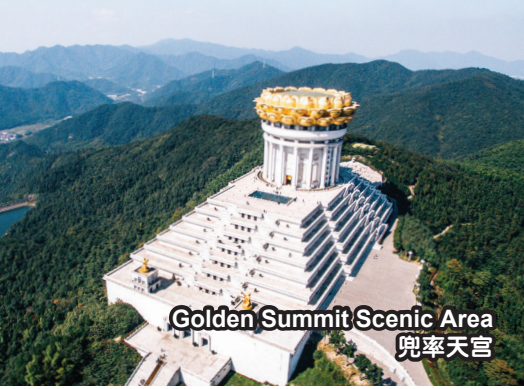
Golden Summit Scenic Area 兜率天宫