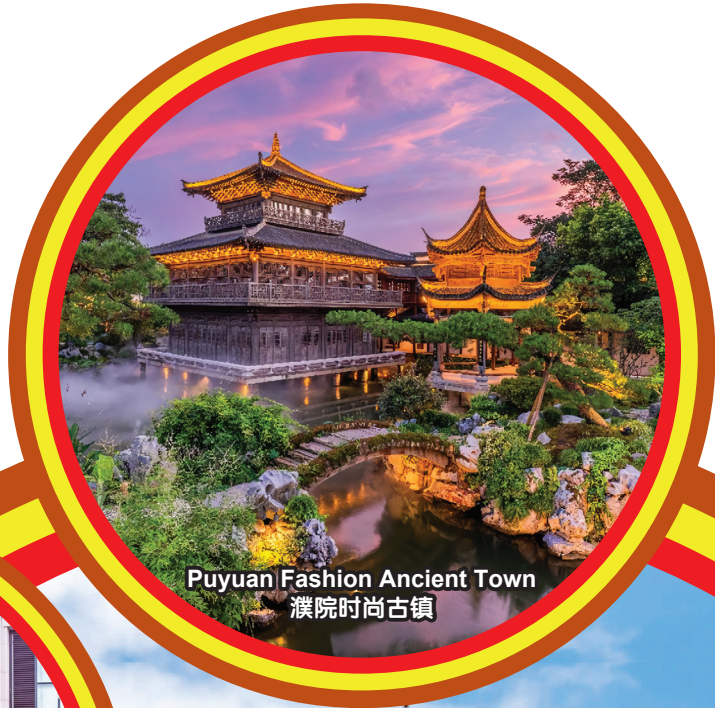
Puyuan Fashion Ancient Town 濮院时尚古镇