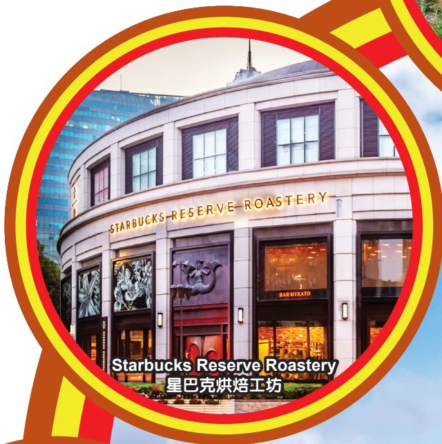
Starbucks Reserve Roastery 星巴克烘焙工坊