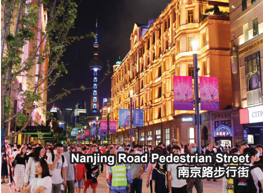
Nanjing Road Pedestrian Street 南京路步行街