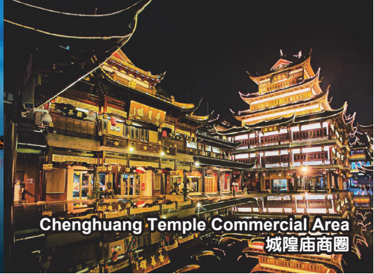
Chenghuang Temple Commercial Area 城隍庙商圈