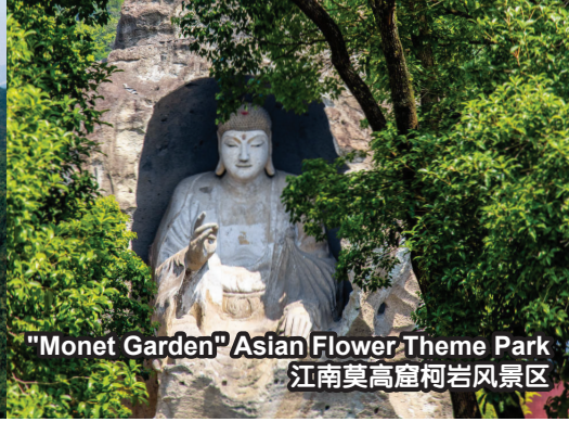
"Monet Garden" Asian Flower Theme Park 江南莫高窟柯岩风景区