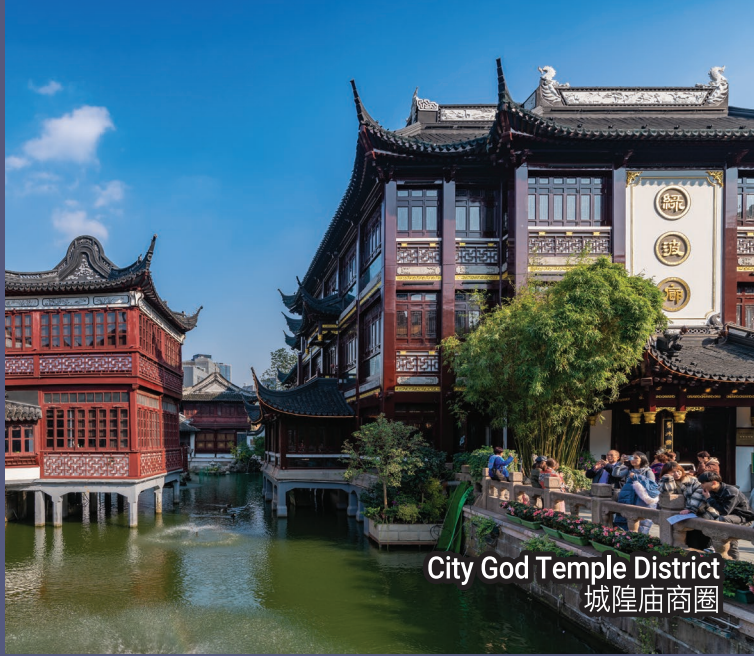
City God Temple District 城隍庙商圈