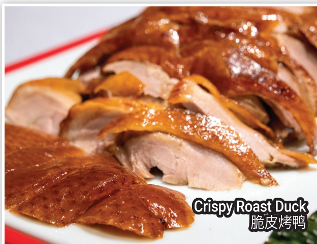
Crispy Roast Duck 脆皮烤鸭