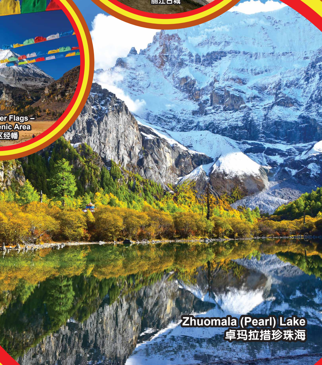
Zhuomala (Pearl) Lake 卓玛拉措珍珠海