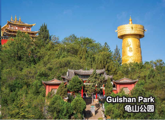
Guishan Park 龟山公园