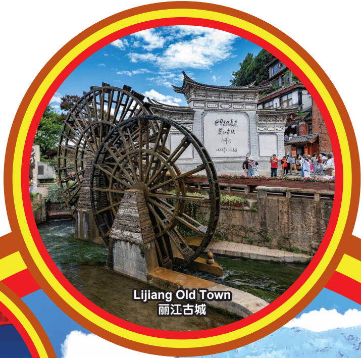
Lijiang Old Town 丽江古城