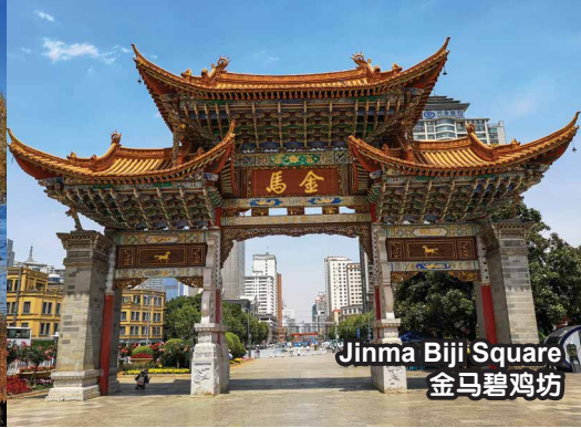
Jinma Biji Square 金马碧鸡坊