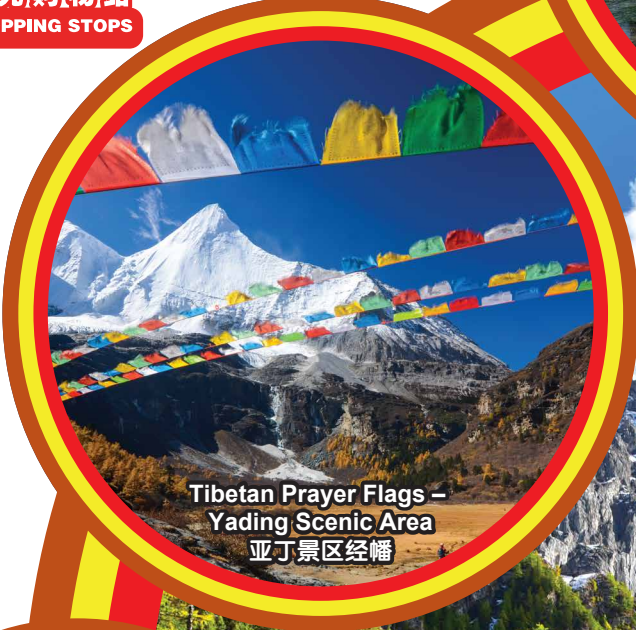
Tibetan Prayer Flags - Yading Scenic Area 亚丁景区经幡