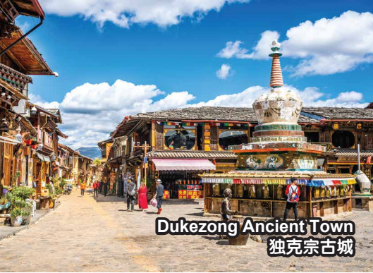
Dukezong Ancient Town 独克宗古城