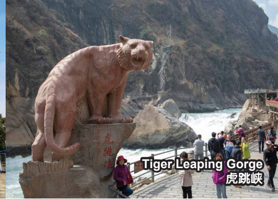
Tiger Leaping Gorge 虎跳峡