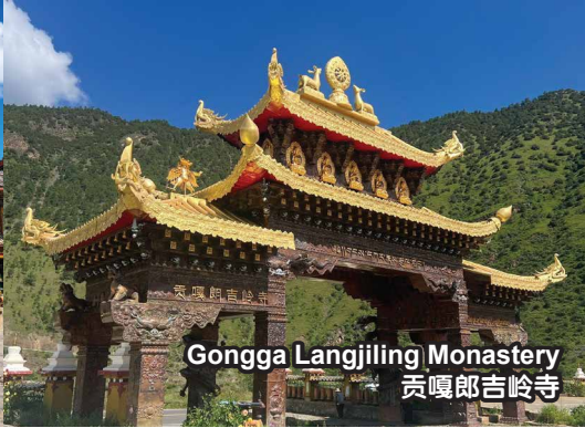
Gongga Langjiling Monastery 贡嘎郎吉岭寺