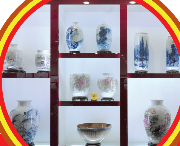
The China Ceramic Museum 中国陶瓷博物馆

*亲手点燃饱含祝福的莲花祈福水灯 Lotus Prayer Water Lanterns