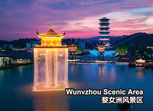
Wunvzhou Scenic Area 婺女洲风景区