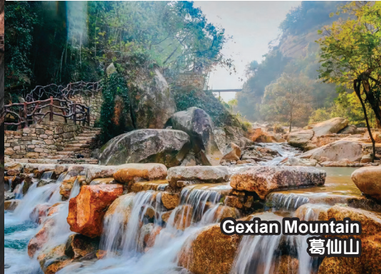
Gexian Mountain 葛仙山