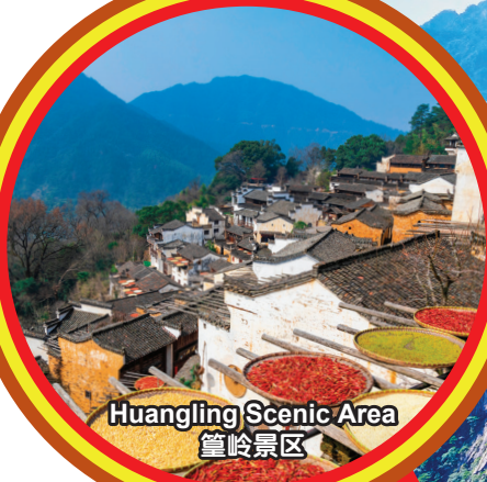
Huangling Scenic Area 篁岭景区

行程次序，以當地旅社安排為準。 Sequences of Itinerary are subject to local arrangement.