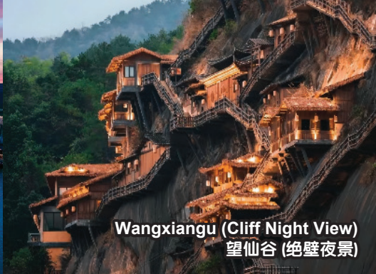
Wangxiangu (Cliff Night View) 望仙谷 (绝壁夜景)