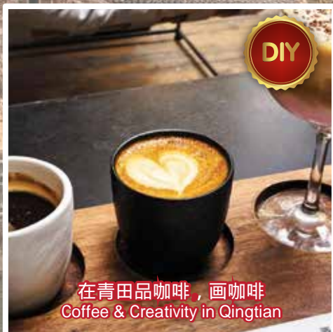
在青田品咖啡，画咖啡 Coffee & Creativity in Qingtian