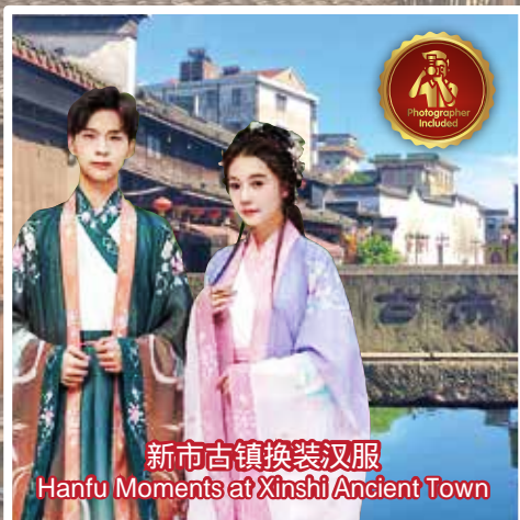
新市古镇换装汉服 Hanfu Moments at Xinshi Ancient Town

我们精心安排，让你即使在一个国度，也能走出不一般的深度之旅。 我们也深信，没有什么比一趟深刻的旅游所带来的回忆，能更隽永、能更让你动容。