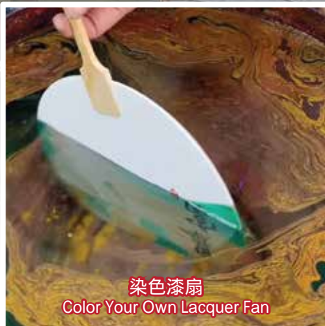
染色漆扇 Color Your Own Lacquer Fan