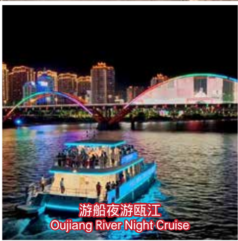
游船夜游瓯江 Oujiang River Night Cruise