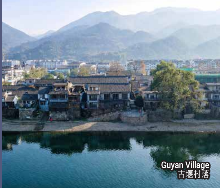
Guyan Village 古堰村落