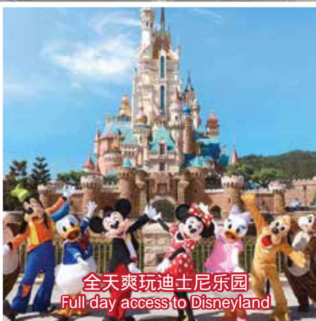
全天畅玩迪士尼乐园 Full day access to Disneyland