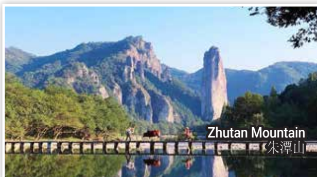
Zhutan Mountain 朱潭山