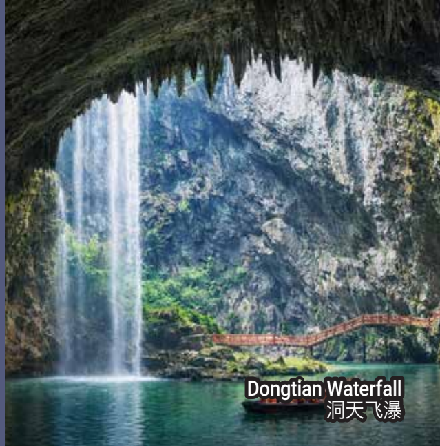
Dongtian Waterfall 洞天飞瀑