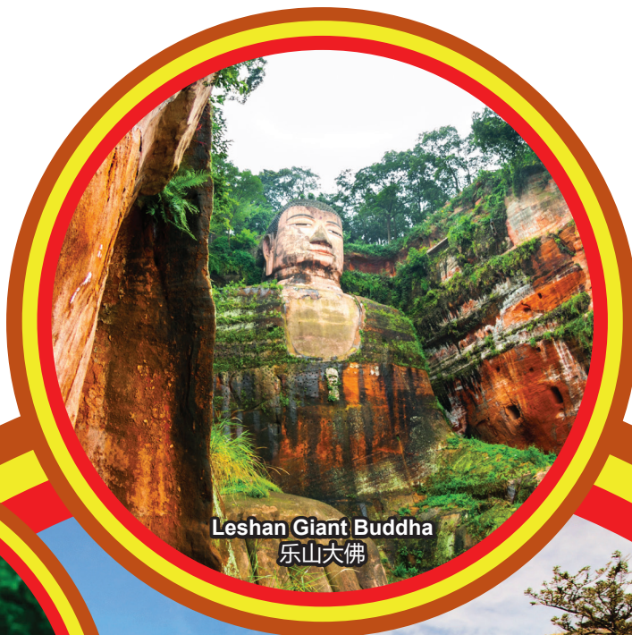
Leshan Giant Buddha 乐山大佛