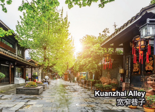
Kuanzhai Alley 宽窄巷子