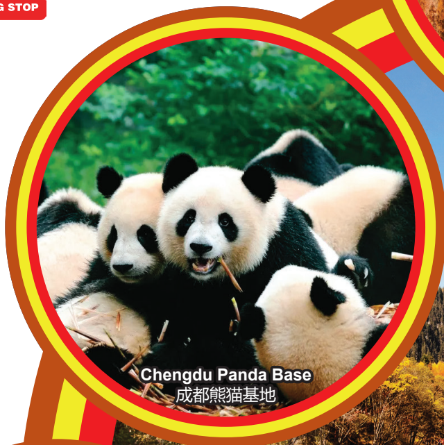
Chengdu Panda Base 成都熊猫基地