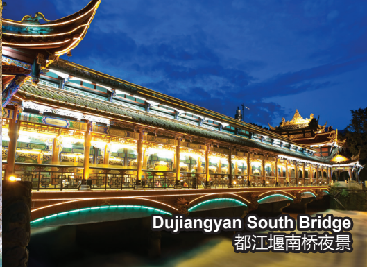
Dujiangyan South Bridge 都江堰南桥夜景