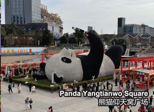
Panda Yangtianwo Square 熊猫仰天窝广场