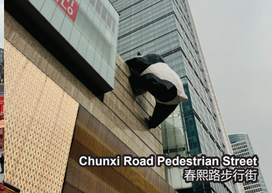
Chunxi Road Pedestrian Street 春熙路步行街