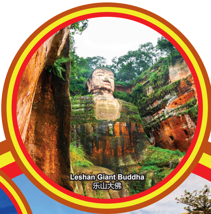
Leshan Giant Buddha 乐山大佛