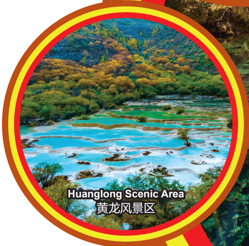
Huanglong Scenic Area 黄龙风景区