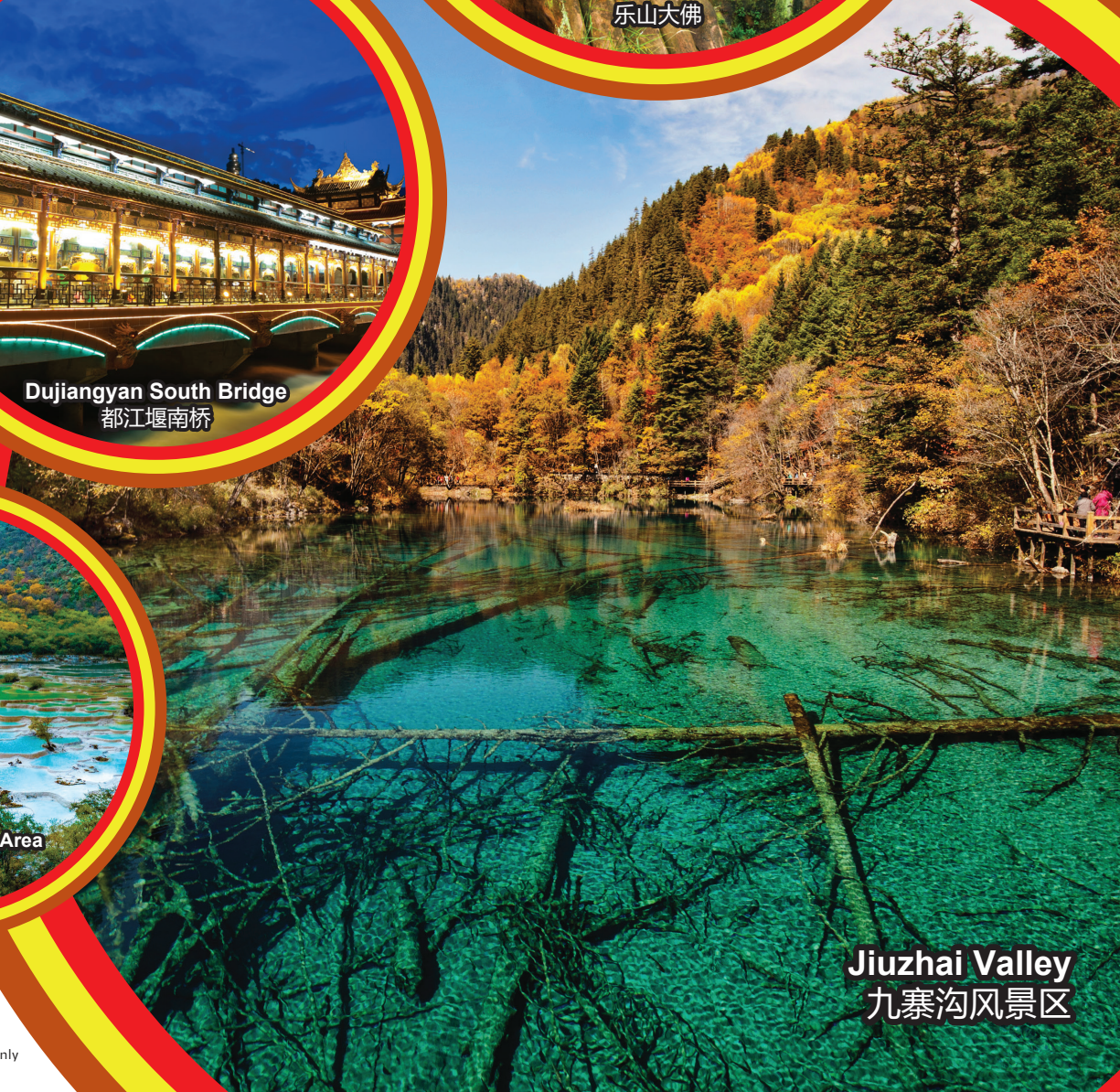
Jiuzhai Valley 九寨沟风景区