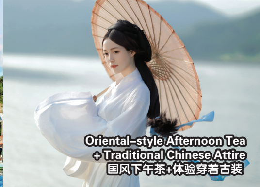
Oriental-style Afternoon Tea + Traditional Chinese Attire 国风下午茶+体验穿着古装