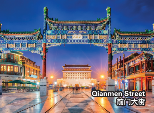
Qianmen Street 前门大街