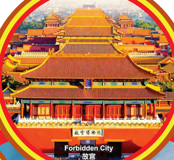
故宫博物院 Forbidden City 故宫