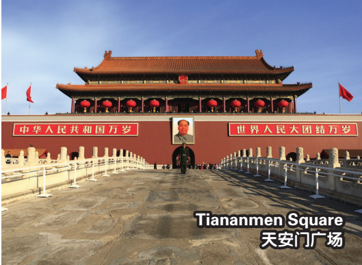
Tiananmen Square 天安门广场