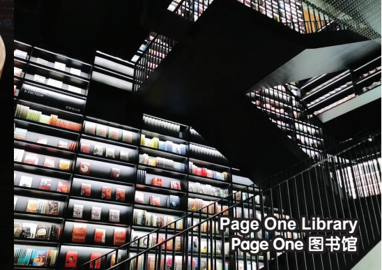
Page One Library Page One 图书馆