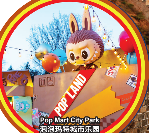
Pop Mart City Park 泡泡玛特城市乐园

行程次序，以当地旅社安排为准。 Sequences of Itinerary are subject to local arrangement.