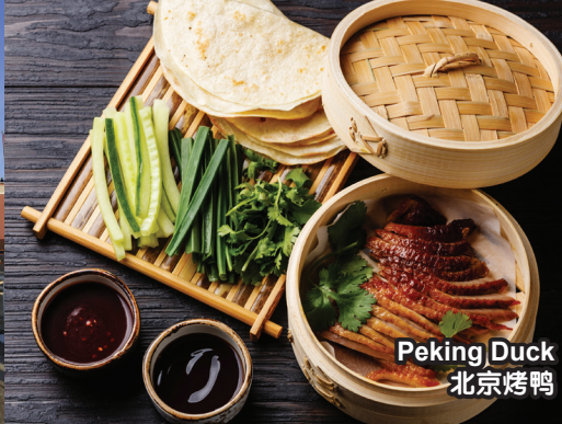
Peking Duck 北京烤鸭