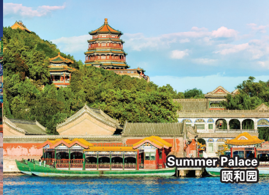
Summer Palace 颐和园