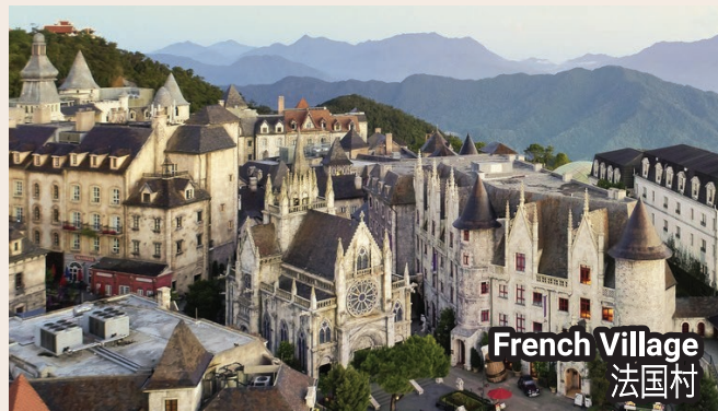
French Village 法国村