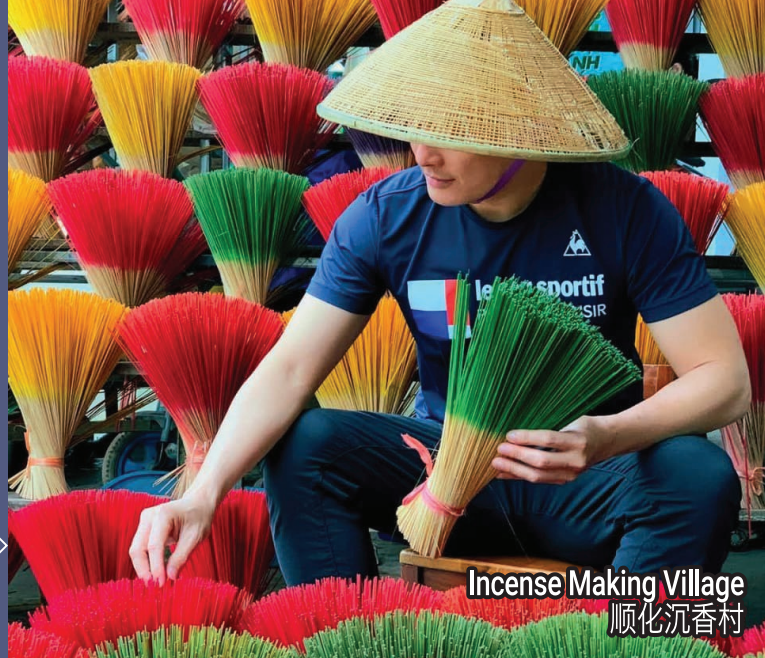
Incense Making Village 顺化沉香村