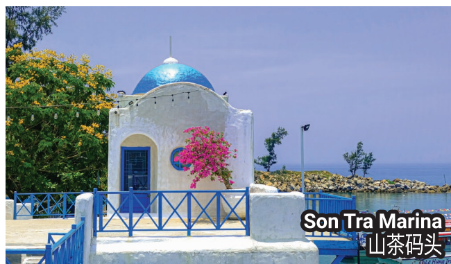
Son Tra Marina 山茶码头