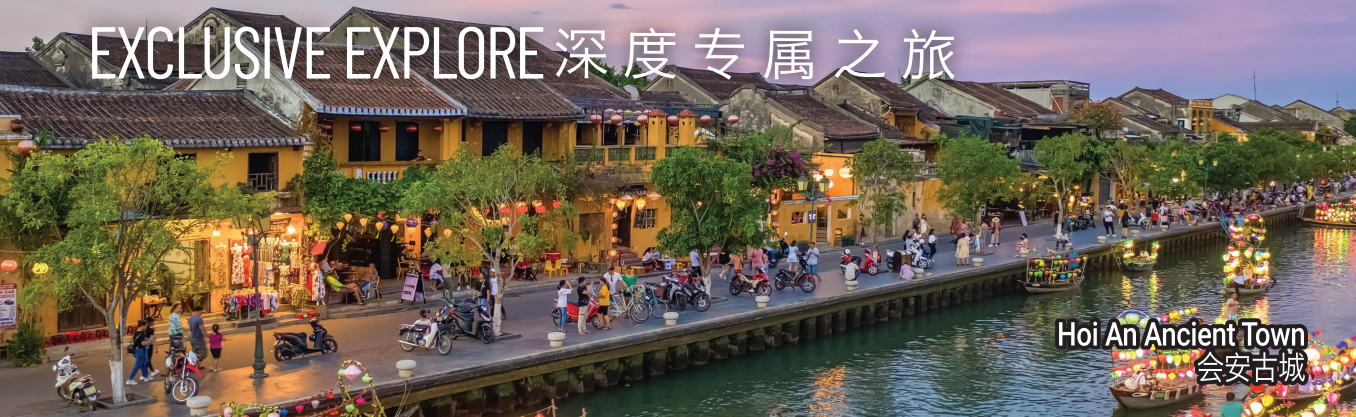
Hoi An Ancient Town 会安古城