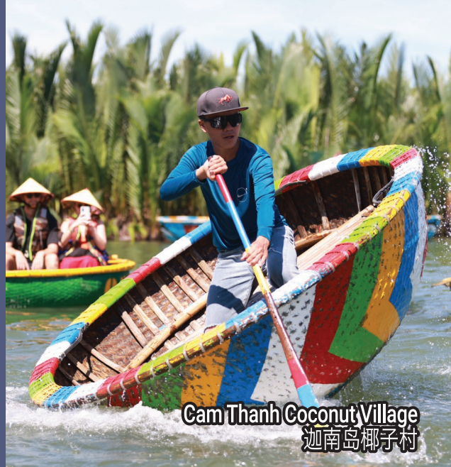
Cam Thanh Coconut Village 迦南岛椰子村