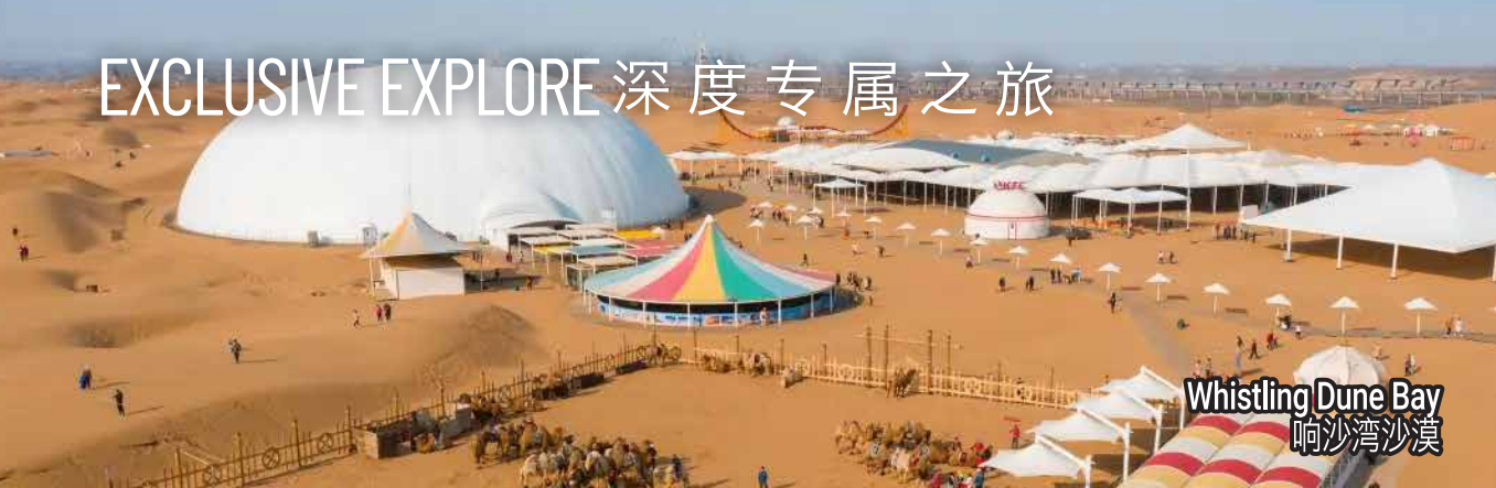
Whistling Dune Bay 响沙湾沙漠