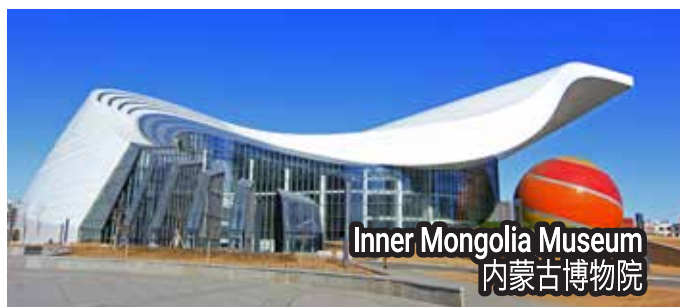
Inner Mongolia Museum 内蒙古博物院