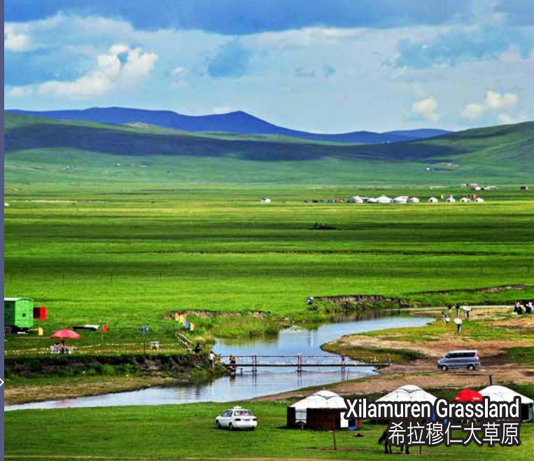
Xilamuren Grassland 希拉穆仁大草原