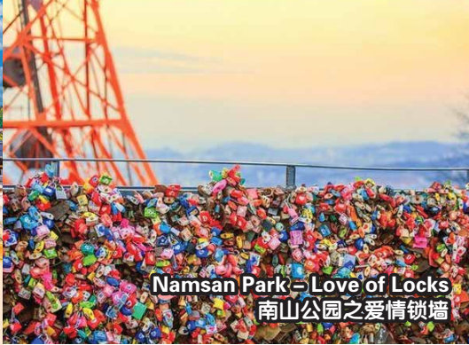
Namsan Park - Love of Locks 南山公园之爱情锁墙