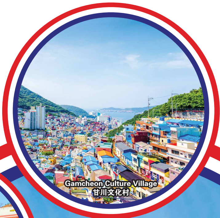
Gamcheon Culture Village 甘川文化村