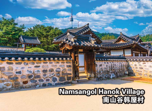
Namsangol Hanok Village 南山谷韩屋村