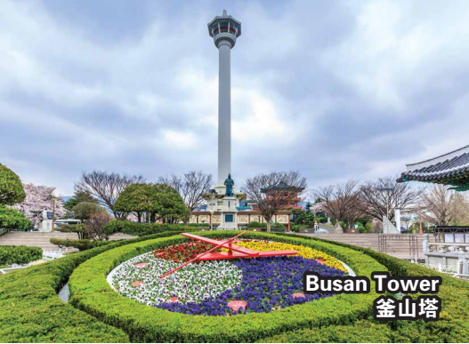
Busan Tower 釜山塔