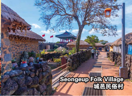
Seongeup Folk Village 城邑民俗村