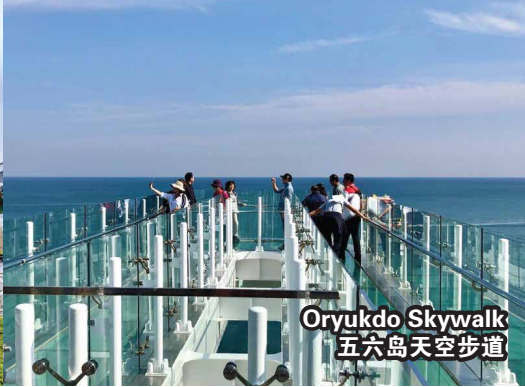
Oryukdo Skywalk 五六岛天空步道