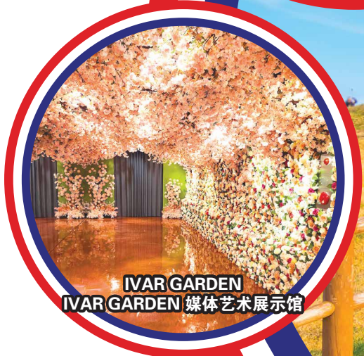
IVAR GARDEN IVAR GARDEN 媒体艺术展示馆