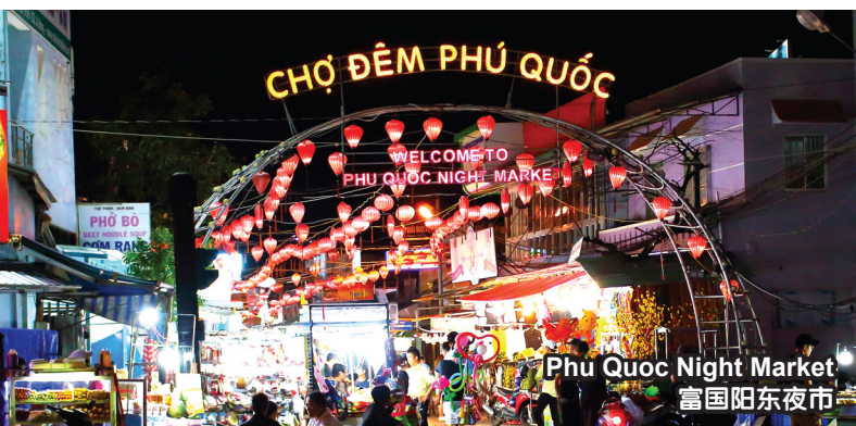
Phu Quoc Night Market 富国阳东夜市

★ Banh Canh ★ Hon Thom Buffet ★ Vietnamese cuisine