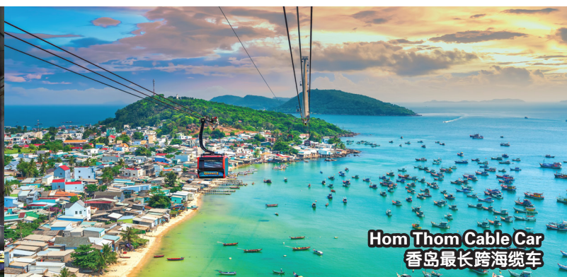
Hon Thom Cable Car 香岛最长跨海缆车

Disclaimer: Due to Covid-19 travel restrictions, local / religious festivals, public holidays, weather condition, transport technical issue, acts of nature, Golden Destinations reserved the right to alter the sequence or change, amend or alter the itinerary if necessary, with or without prior notice.