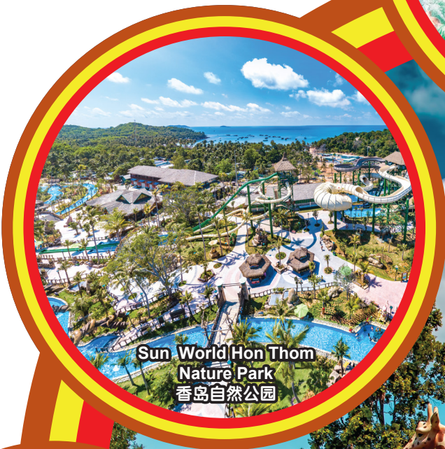
Sun World Hon Thom Nature Park 香岛自然公园