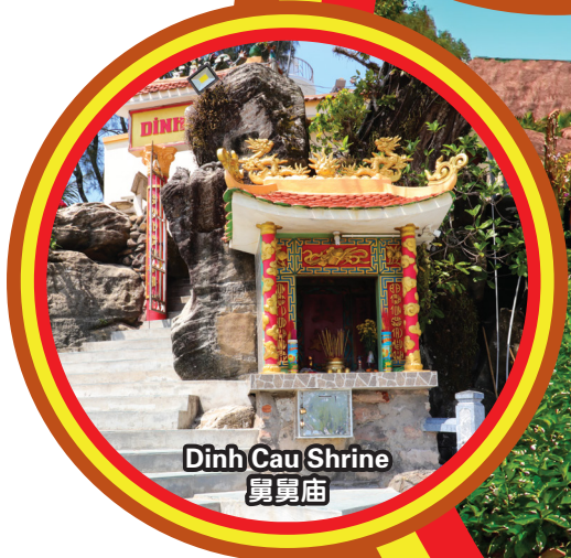
Dinh Cau Shrine 舅舅庙