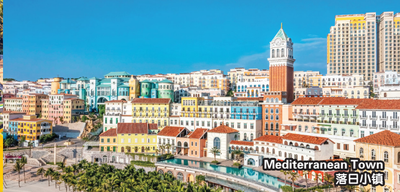
Mediterranean Town 落日小镇