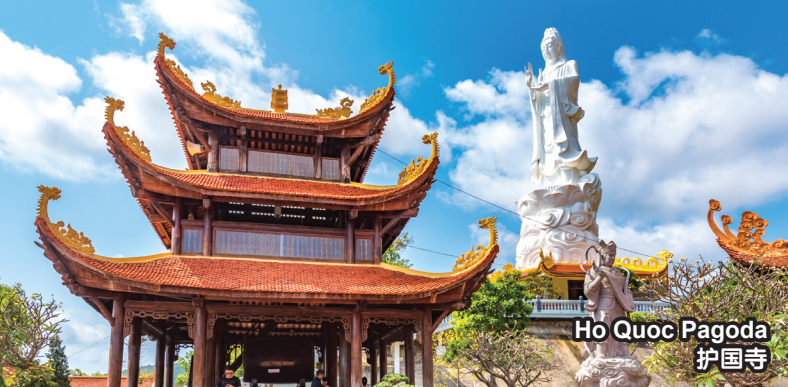
Ho Quoc Pagoda 护国寺