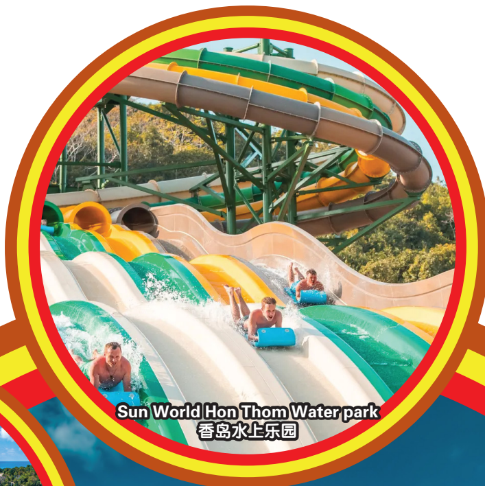
Sun World Hon Thom Water park 香岛水上乐园