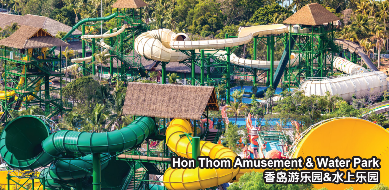
Hon Thom Amusement & Water Park 香岛游乐园&水上乐园