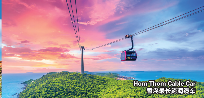
Hom Thom Cable Car 香岛最长跨海缆车