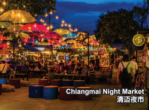
Chiangmai Night Market 清迈夜市