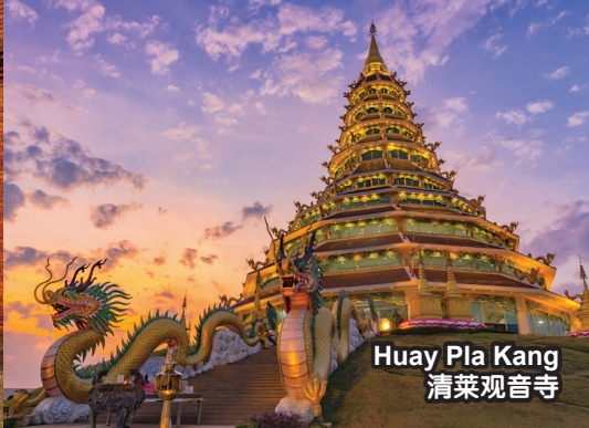
Huay Pla Kang 清莱观音寺