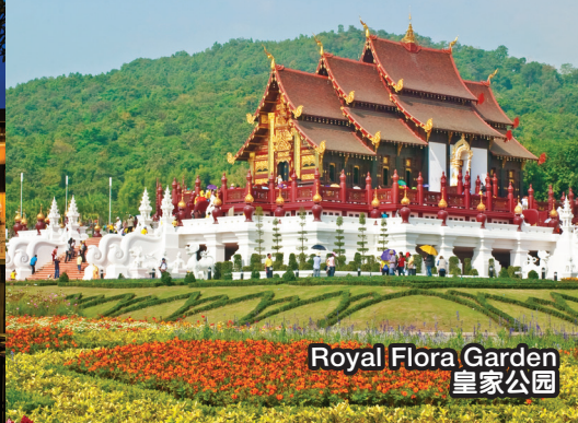
Royal Flora Garden 皇家公园