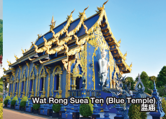
Wat Rong Suea Ten (Blue Temple) 蓝庙