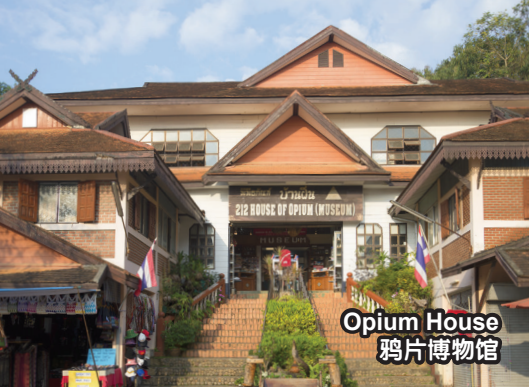
Opium House 鸦片博物馆