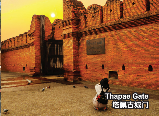
Thapae Gate 塔佩古城门