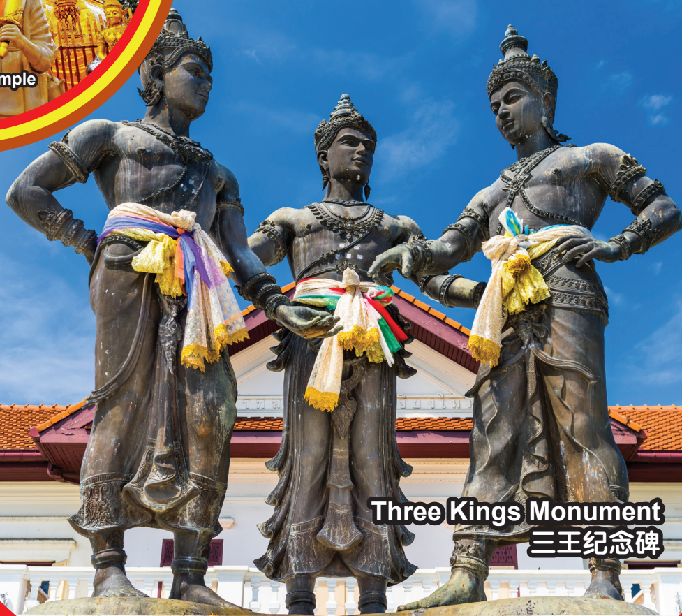
Three Kings Monument 三王纪念碑

行程次序，以當地旅社安排為準。 Sequences of Itinerary are subject to local arrangement.