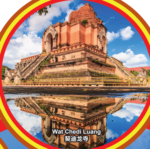
Wat Chedi Luang 契迪龙寺