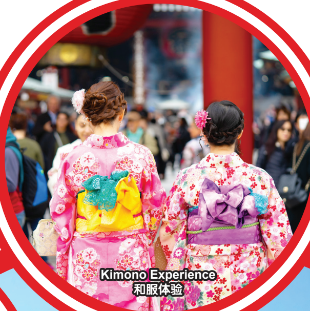
Kimono Experience 和服体验