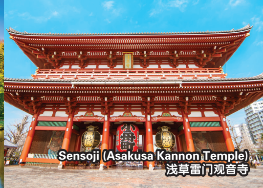
Sensoji (Asakusa Kannon Temple) 浅草雷門観音寺