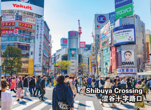
Shibuya Crossing 涩谷十字路口