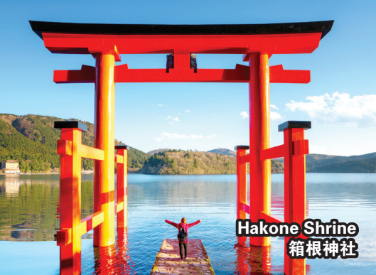
Hakone Shrine 箱根神社