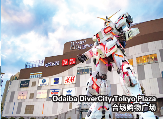
Odaiba DiverCity Tokyo Plaza 台场购物广场