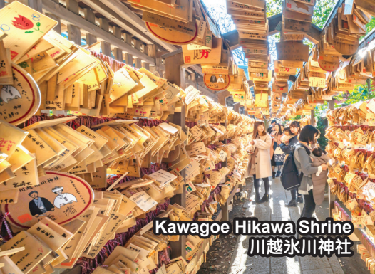
Kawagoe Hikawa Shrine 川越氷川神社