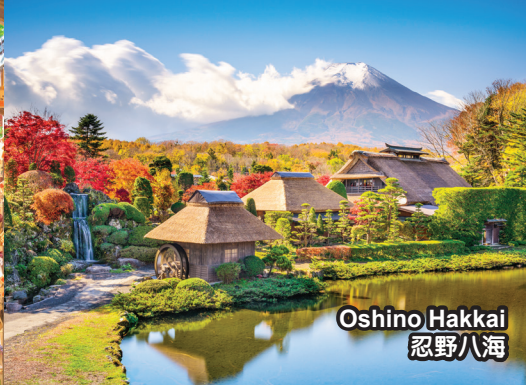
Oshino Hakkai 忍野八海