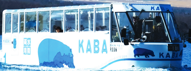
Yamanakaku KABA Bus 山中湖的河马 (水陆两用巴士)

行程次序，以当地旅社安排为准。 Sequences of Itinerary are subject to local arrangement.