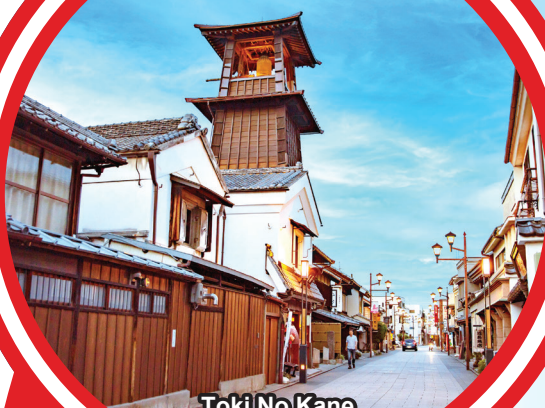
Toki No Kane 川越時の钟