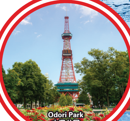
Odori Park 大通公园

行程次序，以當地旅社安排為準。 Sequences of Itinerary are subject to local arrangement.