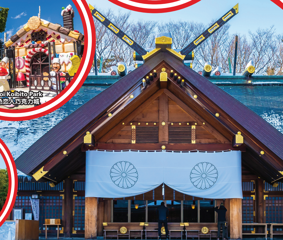
Hokkaido Shrine 北海道神宮

行程次序，以當地旅社安排為準。 Sequences of Itinerary are subject to local arrangement.