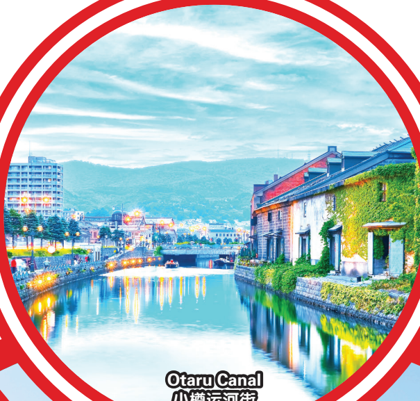
Otaru Canal 小樽运河街