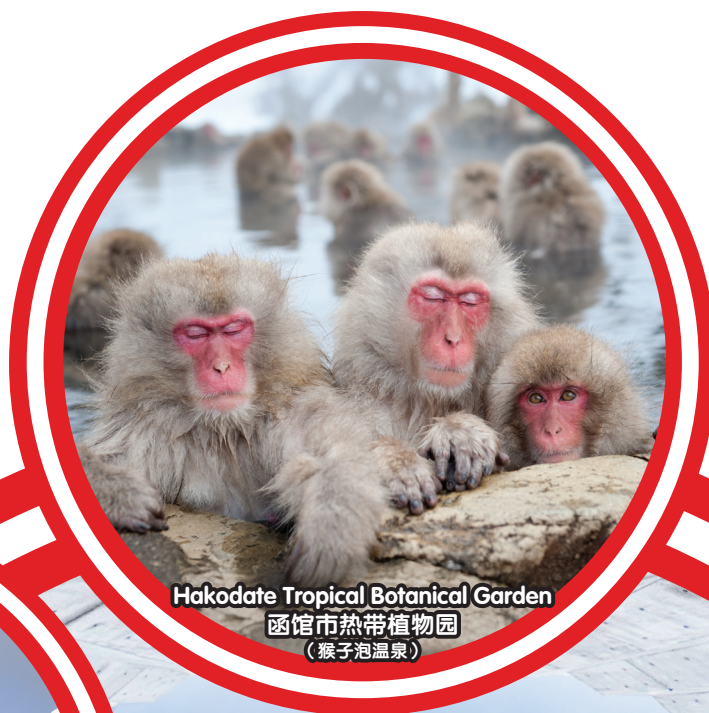
Hakodate Tropical Botanical Garden 函馆市热带植物园 (猴子泡温泉)