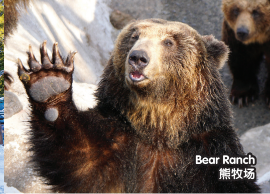
Bear Ranch 熊牧场