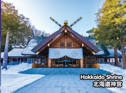
Hokkaido Shrine 北海道神宫