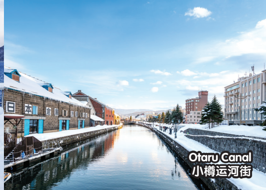
Otaru Canal 小樽运河街