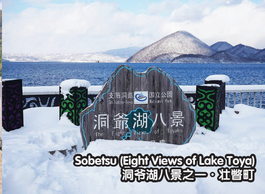
Sobetsu (Eight Views of Lake Toya) 洞爷湖八景之一・壮瞥町