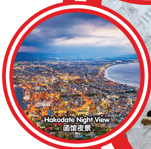
Hakodate Night View 函馆夜景