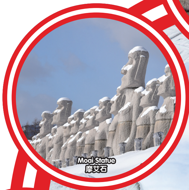
Moai Statue 摩艾石