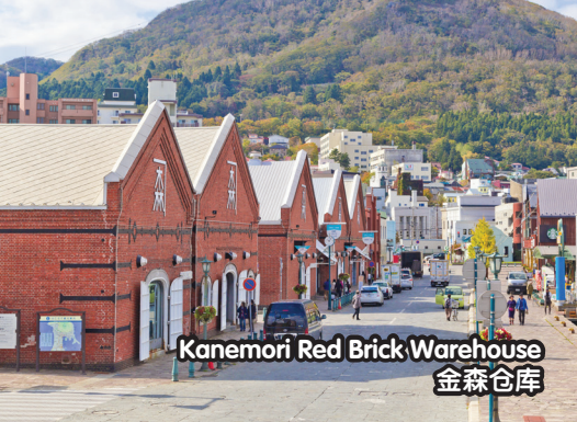
Kanamori Red Brick Warehouse 金森仓库