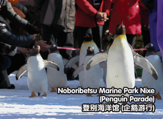
Noboribetsu Marine Park Nixe (Penguin Parade) 登别海洋馆(企鹅游行)