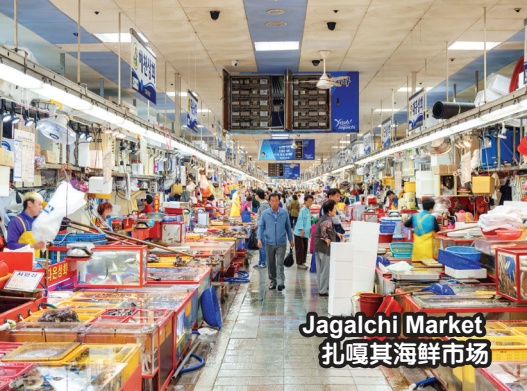
Jagalchi Market 扎嘎其海鲜市场