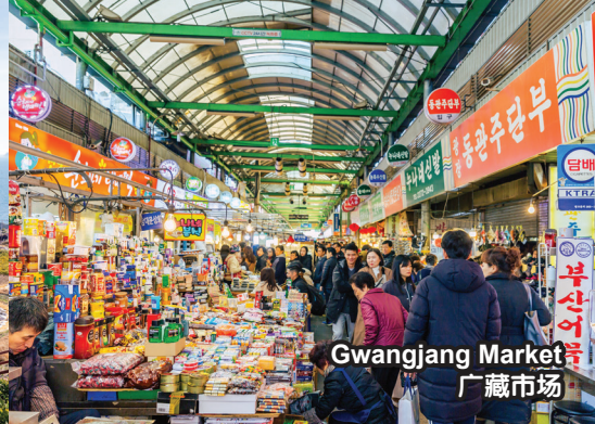
Gwangjang Market 广藏市场