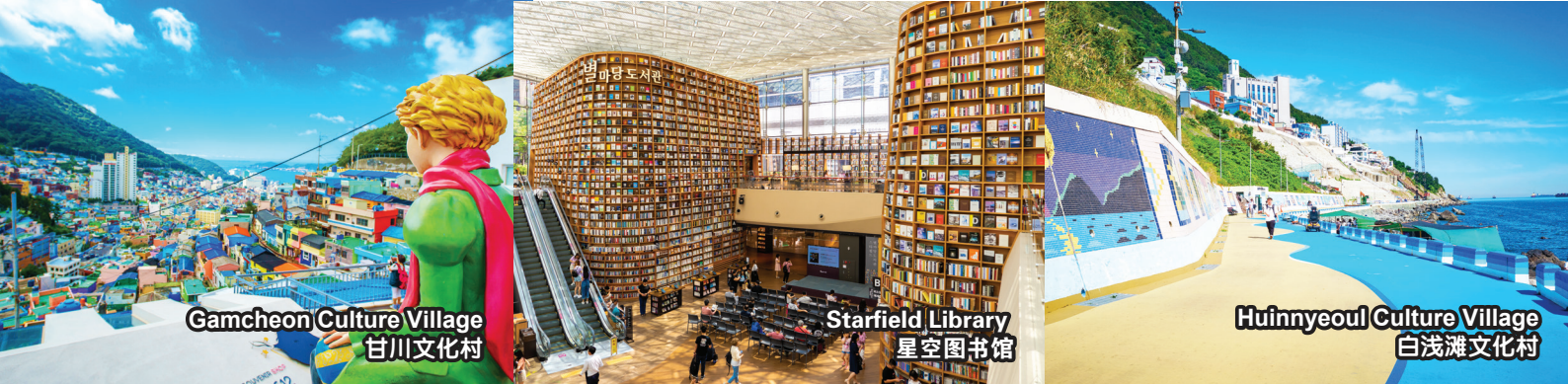
Gamcheon Culture Village 甘川文化村