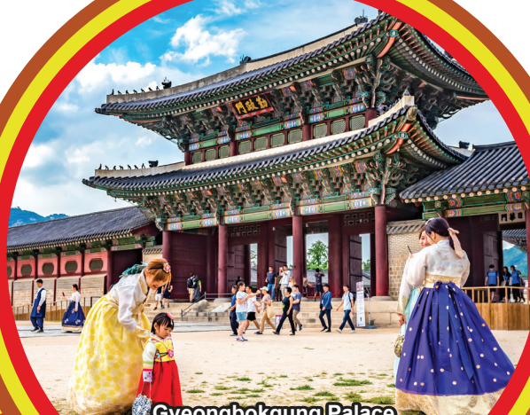
Gyeongbokgung Palace (With Hanbok-wearing experience) 景福宫 (含穿韩服体验)