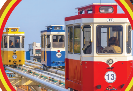
Haeundae Coastal Capsule 海云台天空胶囊列车