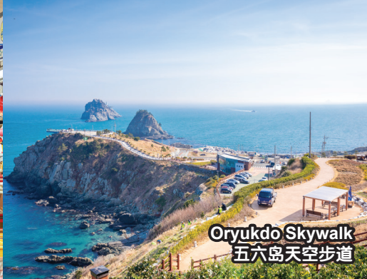
Oryukdo Skywalk 五六岛天空步道