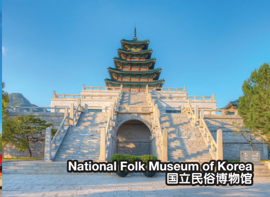
National Folk Museum of Korea 国立民俗博物馆