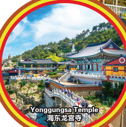
Yonggungsa Temple 海东龙宫寺