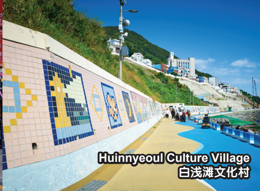
Huinnyeoul Culture Village 白浅滩文化村