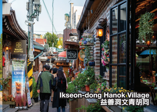
Ikseon-dong Hanok Village 益善洞文青胡同