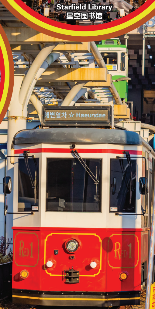
Haeundae Coastal Train 海云台列车