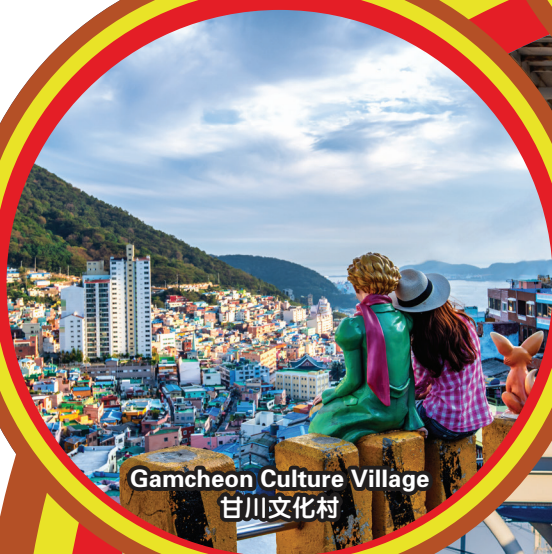
Gamcheon Culture Village 甘川文化村