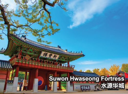
Suwon Hwaseong Fortress 水源华城