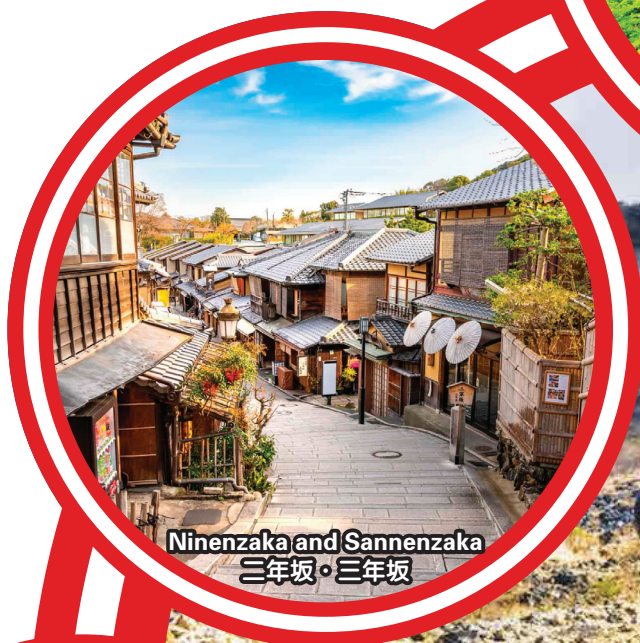
Ninenzaka and Sannenzaka 三年坂・三年坂