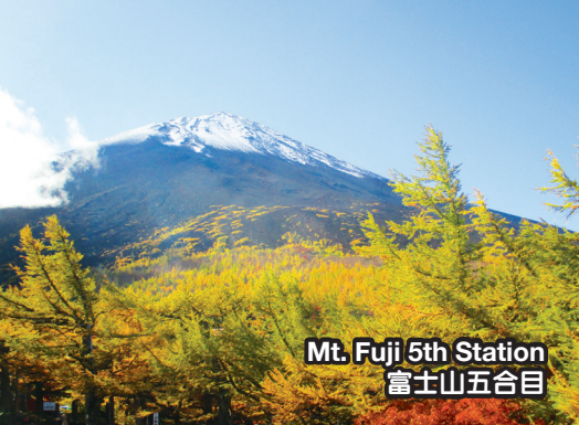
Mt. Fuji 5th Station 富士山五合目