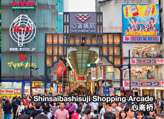
Shinsaibashi Shopping Arcade 心斋桥