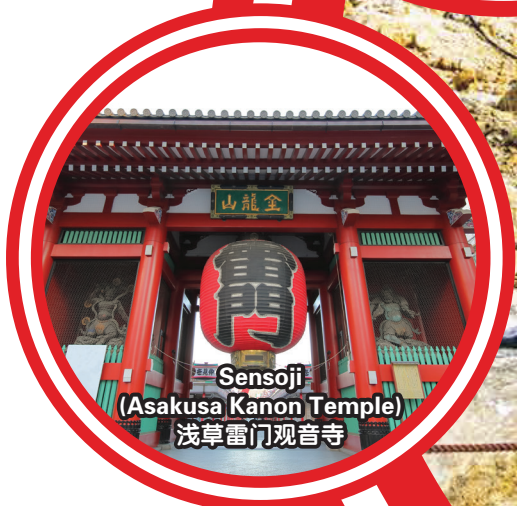
Sensoji (Asakusa Kannon Temple) 浅草雷门观音寺