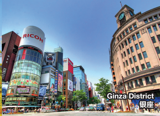
Ginza District 銀座