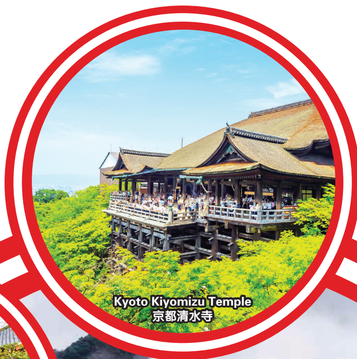
Kyoto Kiyomizu Temple 京都清水寺