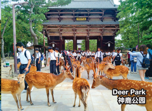
Deer Park 神鹿公园