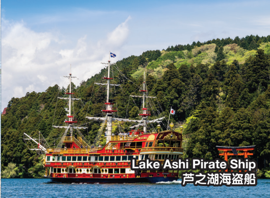
Lake Ashi Pirate Ship 芦之湖海盗船