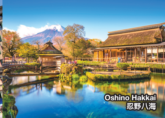
Oshino Hakkai 忍野八海