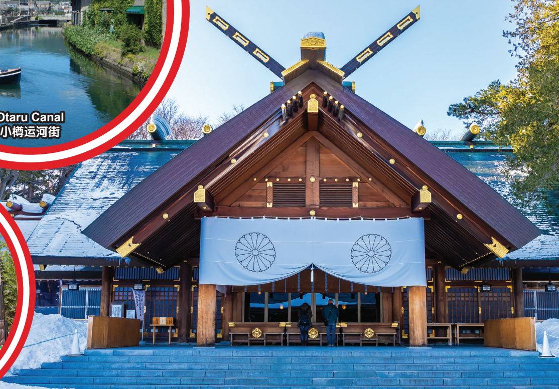
Hokkaido Shrine 北海道神宫