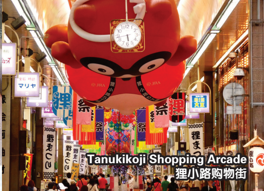
Tanukikoji Shopping Arcade 狸小路购物街