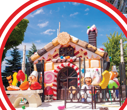
Shiroyoi Koibito Park 白色恋人巧克力城