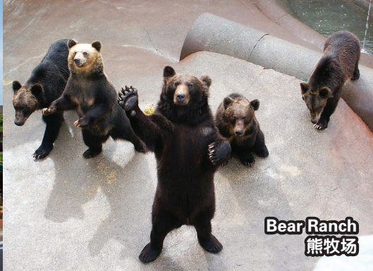
Bear Ranch 熊牧场