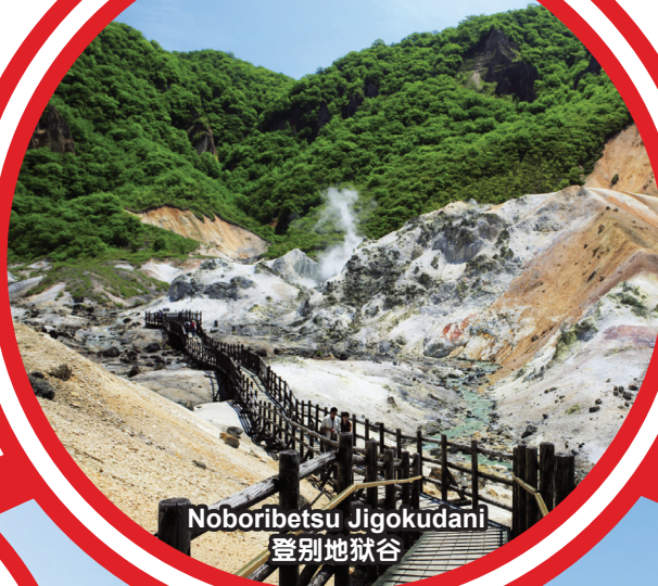
Noboribetsu Jigokudani 登别地狱谷