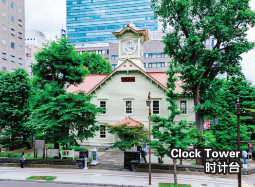
Clock Tower 時計台