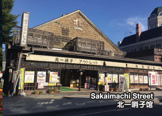
Sakaimachi Street 北一硝子街