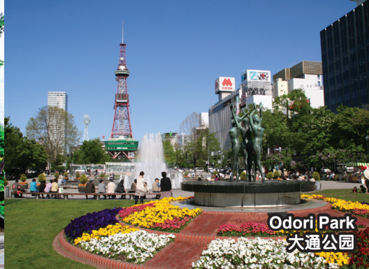
Odori Park 大通公園