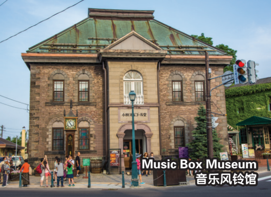
Music Box Museum 音乐风铃馆