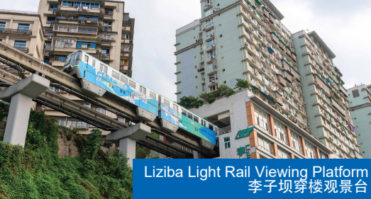
Liziba Light Rail Viewing Platform 李子坝穿楼观景台