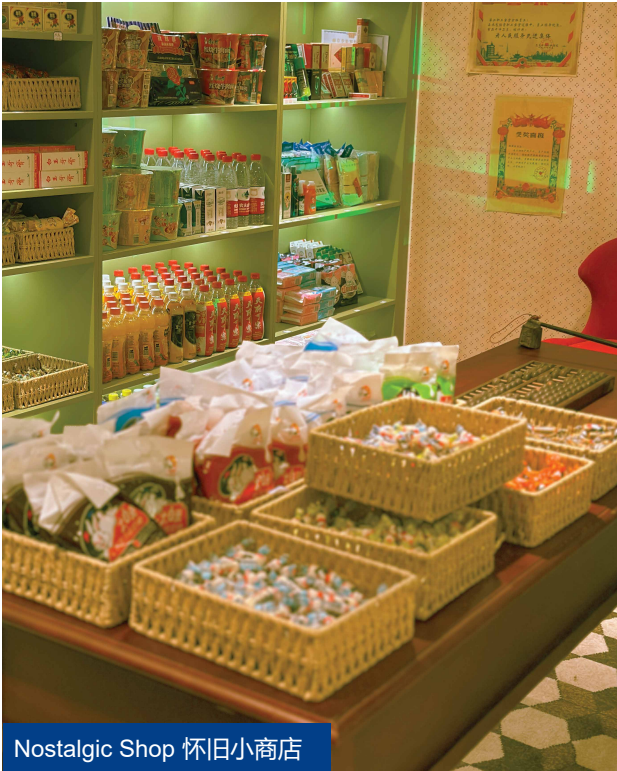
Nostalgic Shop 怀旧小商店