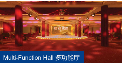
Multi-Function Hall 多功能厅