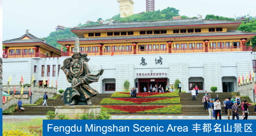
Fengdu Mingshan Scenic Area 丰都名山景区