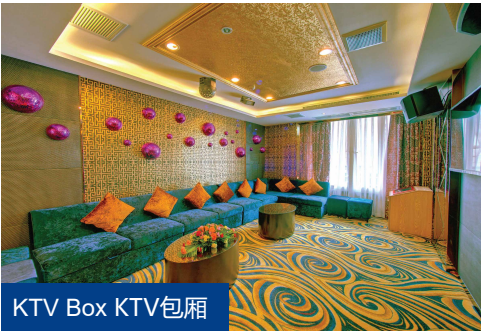
KTV Box KTV包厢