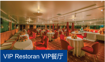
VIP Restoran VIP餐厅