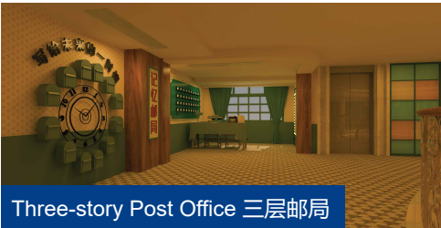
Three-story Post Office 三层邮局

*Remarks: All photos in the itinerary are for illustration purpose only. *备注：行程上的图片仅供参考。