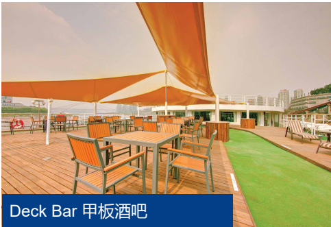
Deck Bar 甲板酒吧