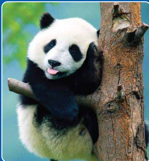
Chongqing Zoo 重庆动物园