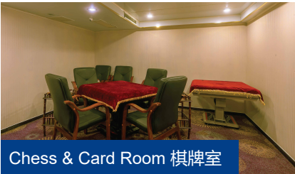
Chess & Card Room 棋牌室