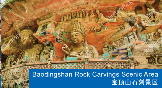
Baodingshan Rock Carvings Scenic Area 宝顶山石刻景区