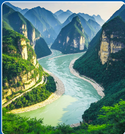
Yangtze Three Gorges 长江三峡