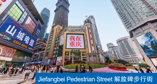
Jiefangbei Pedestrian Street 解放碑步行街