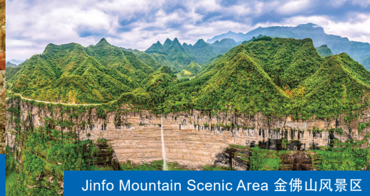
Jinfo Mountain Scenic Area 金佛山风景区