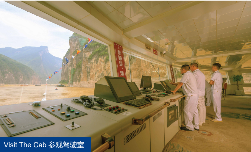
Visit The Cab 参观驾驶室