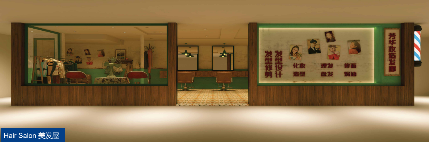
Hair Salon 美发屋