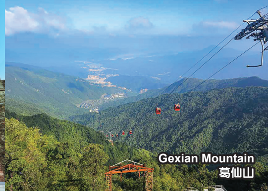
Gexian Mountain 葛仙山