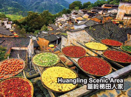
Huangling Scenic Area 篁岭梯田人家