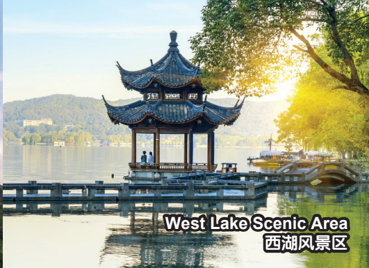
West Lake Scenic Area 西湖风景区