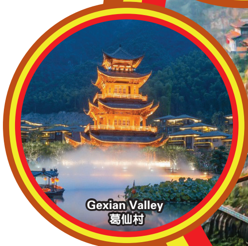
Gexian Valley 葛仙村