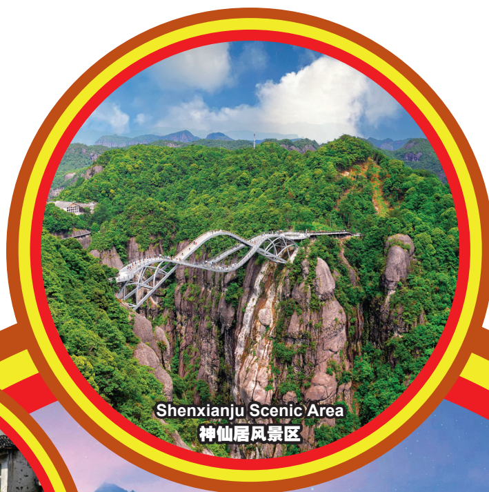
Shenxianju Scenic Area 神仙居风景区