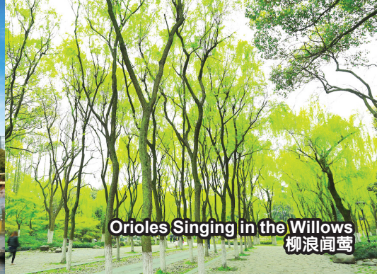
Orioles Singing in the Willows 柳浪闻莺