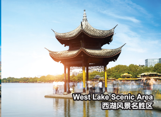
West Lake Scenic Area 西湖风景名胜区