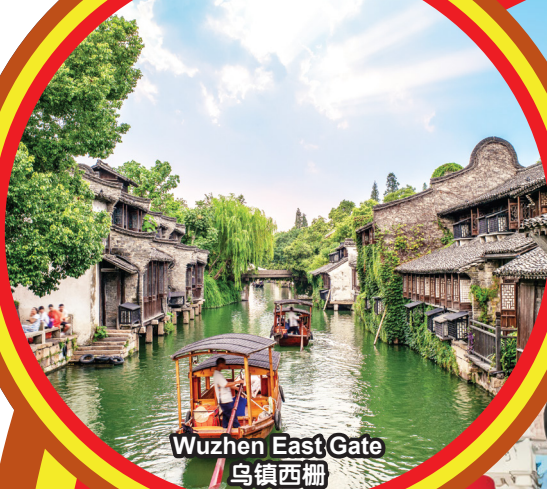
Wuzhen East Gate 乌镇西栅