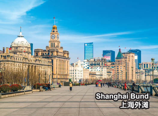
Shanghai Bund 上海外滩