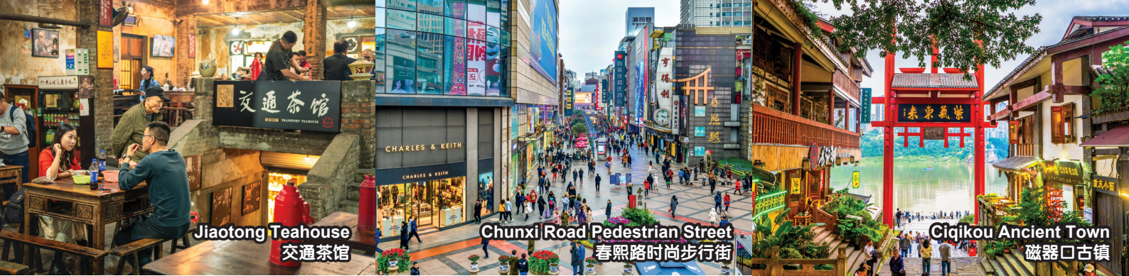
Jiaotong Teahouse 交通茶馆