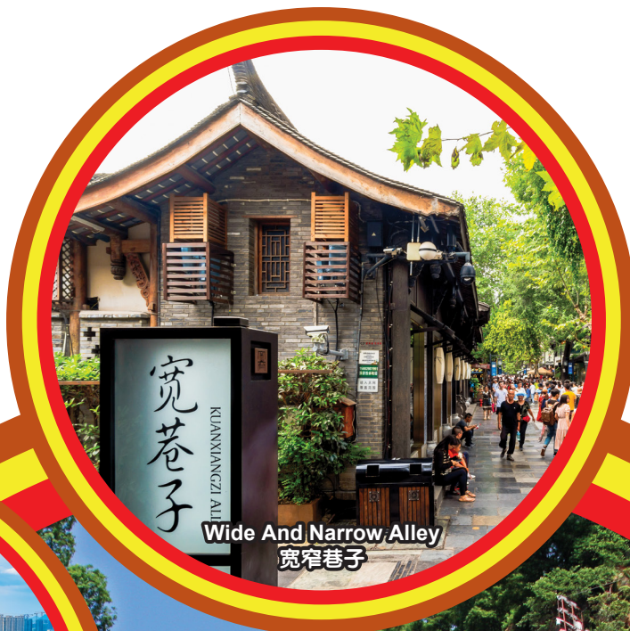
Wide And Narrow Alley 宽窄巷子