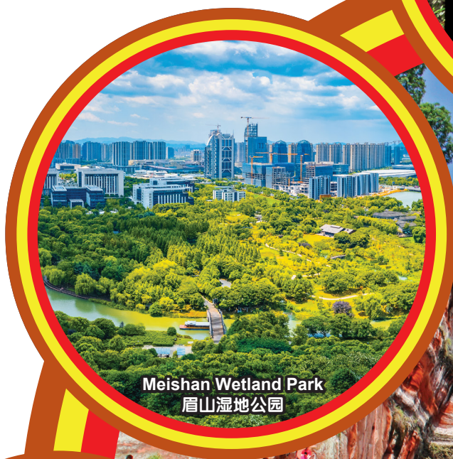
Meishan Wetland Park 眉山湿地公园