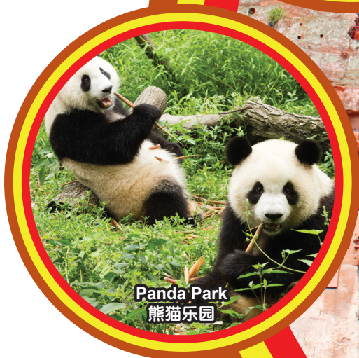
Panda Park 熊猫乐园