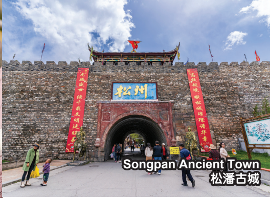
Songpan Ancient Town 松潘古城