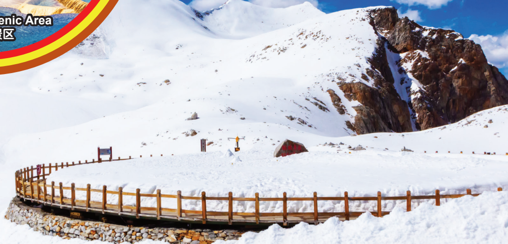
Dagu Glacier National Park 达古冰川

行程次序，以当地旅社安排为准。 Sequences of Itinerary are subject to local arrangement.