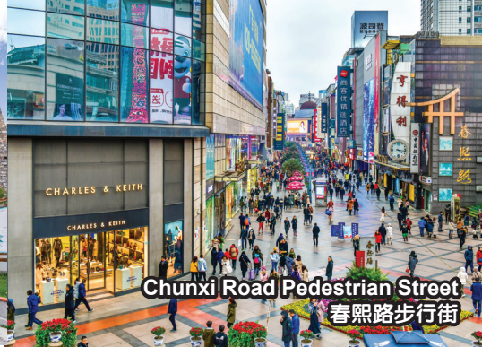
Chunxi Road Pedestrian Street 春熙路步行街