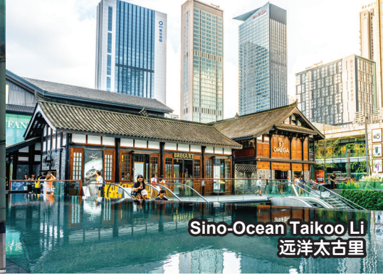
Sino-Ocean Taikoo Li 远洋太古里