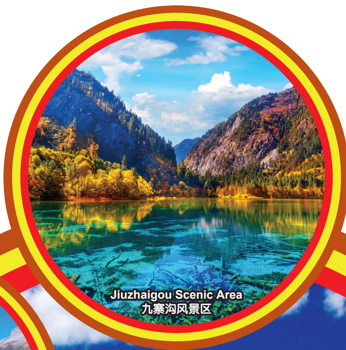
Jiuzhaigou Scenic Area 九寨沟风景区