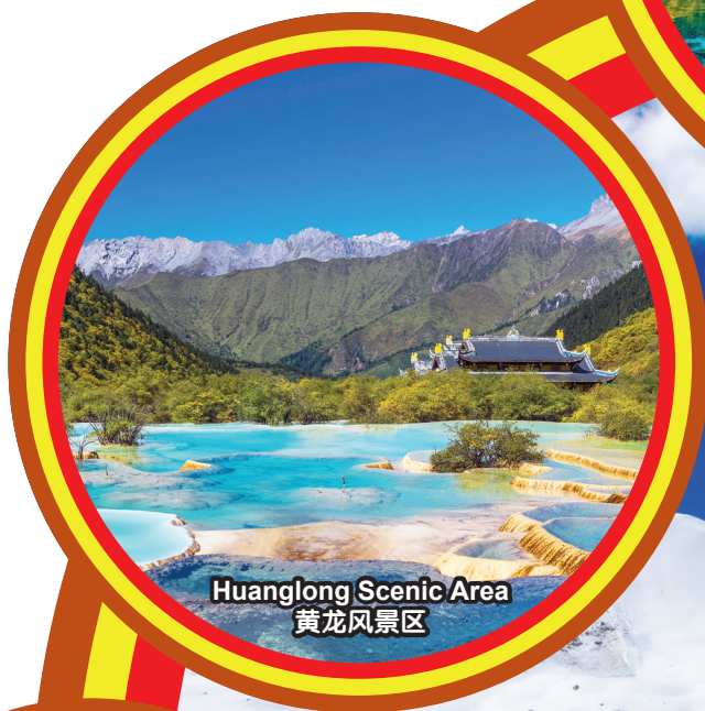
Huanglong Scenic Area 黄龙风景区