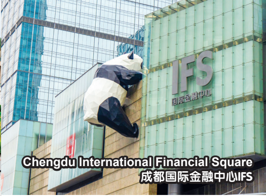
Chengdu International Financial Square 成都国际金融中心IFS