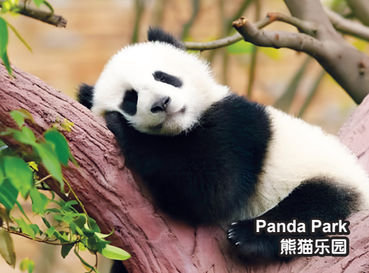
Panda Park 熊猫乐园