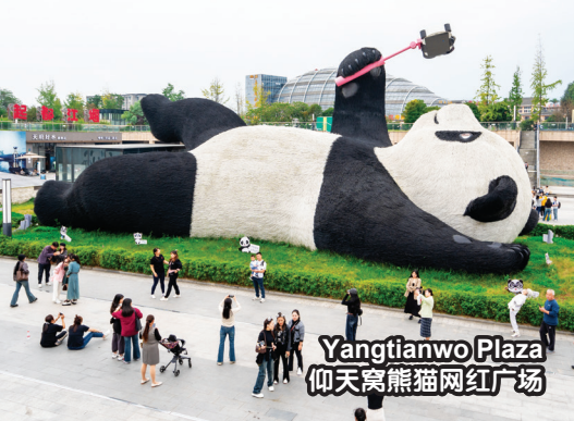
Yangtze River Giant Panda Museum 仰天窝熊猫网红广场