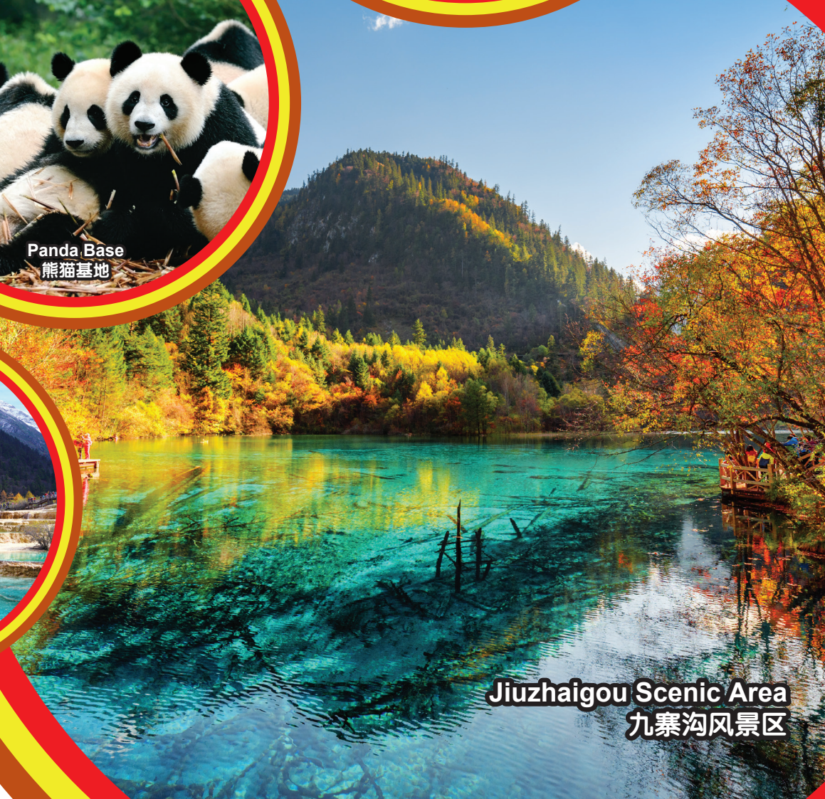
Jiuzhaigou Scenic Area 九寨沟风景区

行程次序，以当地旅社安排为准。 Sequences of Itinerary are subject to local arrangement.