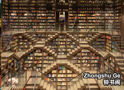
Zhongshu Ge 钟书阁