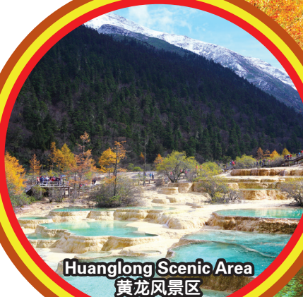
Huanglong Scenic Area 黄龙风景区