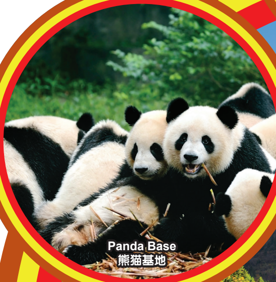
Panda Base 熊猫基地