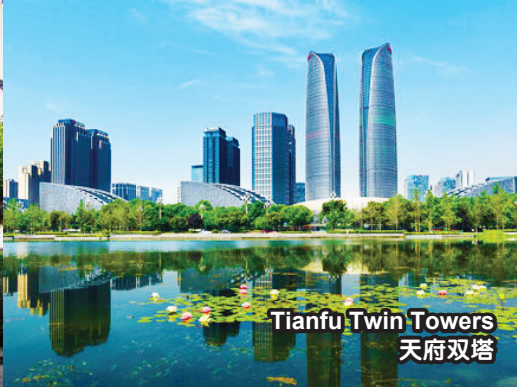
Tianfu Twin Towers 天府双塔