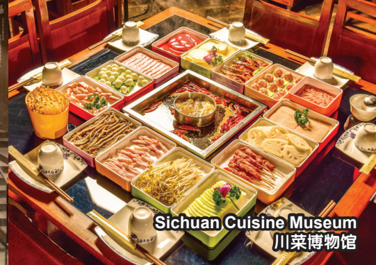
Sichuan Cuisine Museum 川菜博物馆