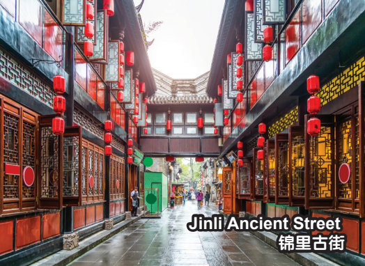
Jinli Ancient Street 锦里古街