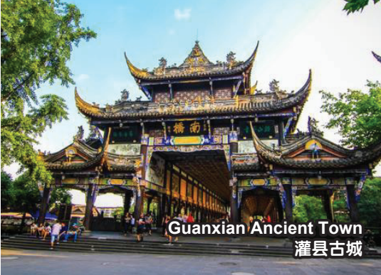
Guanxian Ancient Town 灌县古城