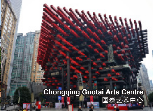
Chongqing Guotai Arts Centre 国泰艺术中心