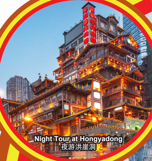
Night Tour at Hongyadong 夜游洪崖洞