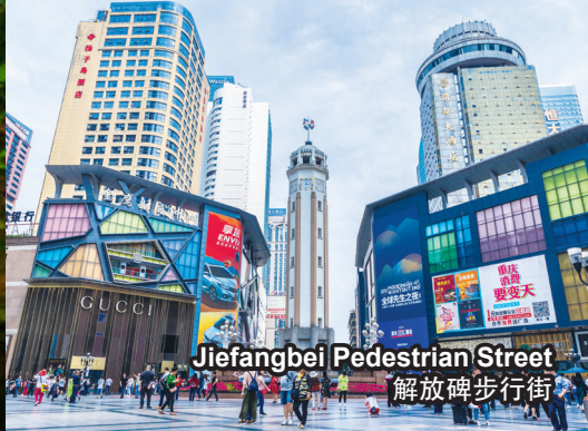
Jiefangbei Pedestrian Street 解放碑步行街