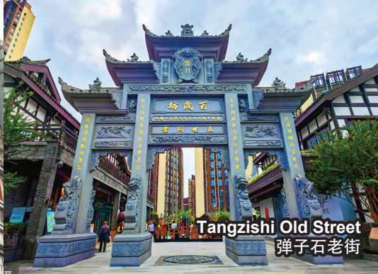
Tangzishi Old Street 弹子石老街