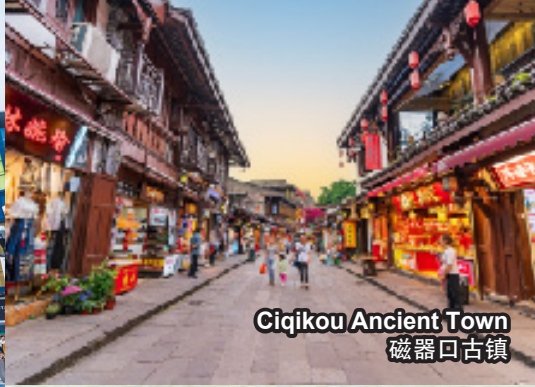
Ciqikou Ancient Town 磁器口古镇