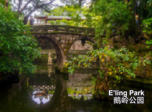
E'ling Park 鹅岭公园