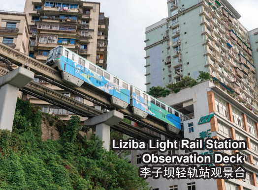
Liziba Light Rail Station Observation Deck 李子坝轻轨站观景台