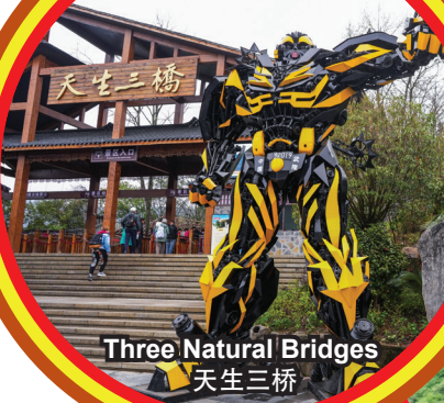
Three Natural Bridges 天生三桥