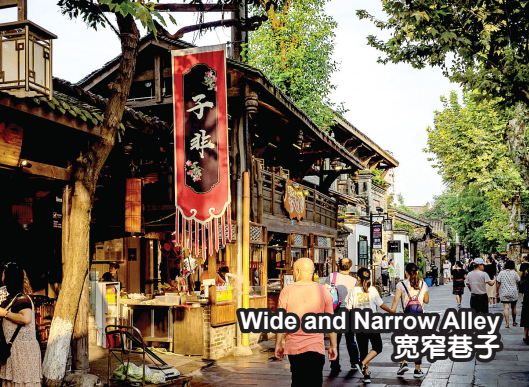
Wide and Narrow Alley 宽窄巷子