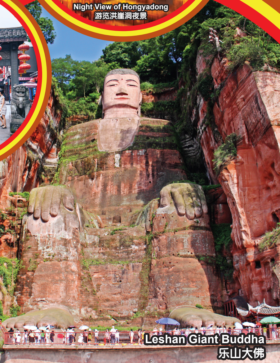
Leshan Giant Buddha 乐山大佛

行程次序，以当地旅社安排为准。 Sequences of Itinerary are subject to local arrangement.