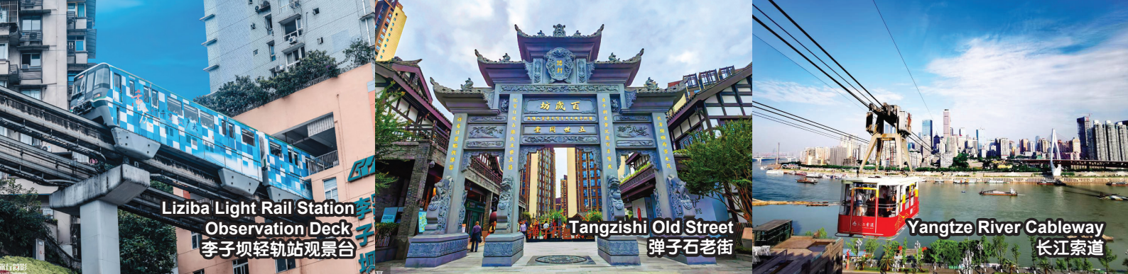
Liziba Light Rail Station Observation Deck 李子坝轻轨站观景台