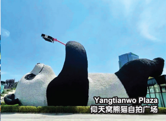
Yangtze River Night View 朝天门熊猫自拍广场