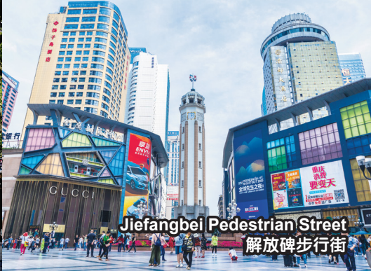
Jiefangbei Pedestrian Street 解放碑步行街