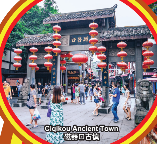
Ciqikou Ancient Town 磁器口古镇