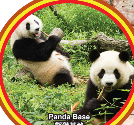
Panda Base 熊猫基地