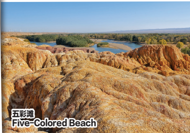
五彩滩 Five-Colored Beach