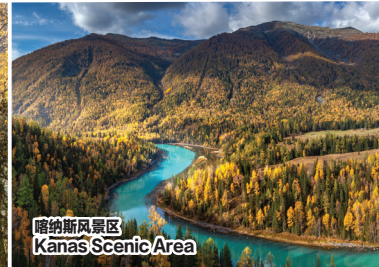
喀纳斯风景区 Kanas Scenic Area