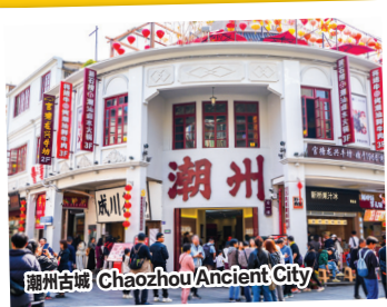
潮州古城 Chaozhou Ancient City