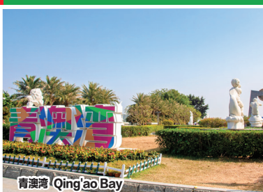
青澳湾 Qing'ao Bay