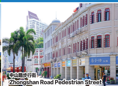
中山路步行街 Zhongshan Road Pedestrian Street