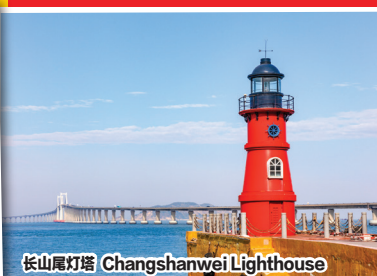
长山尾灯塔 Changshanwei Lighthouse