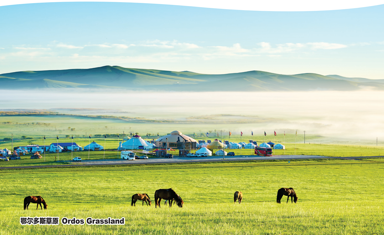
鄂尔多斯草原 Ordos Grassland