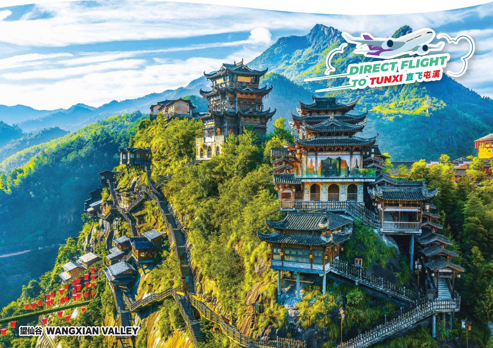
望仙谷 WANGXIAN VALLEY