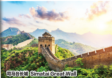
司马台长城 | Simatai Great Wall