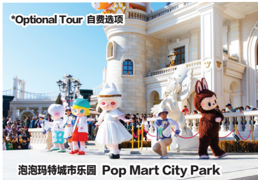
泡泡玛特城市乐园 | Pop Mart City Park