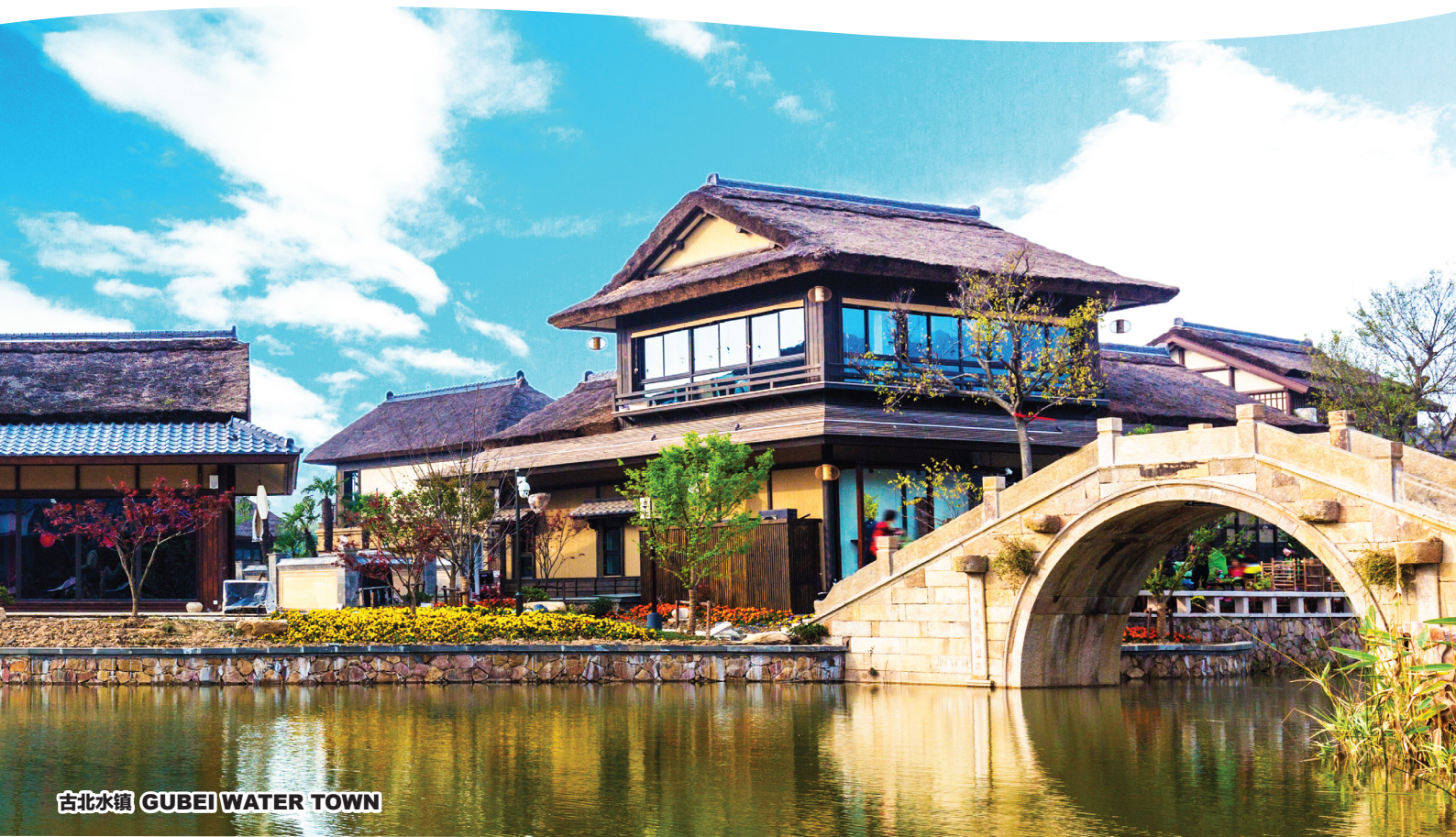
古北水镇 GUBEI WATER TOWN