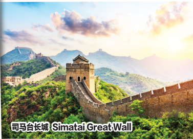
司马台长城 Simatai Great Wall