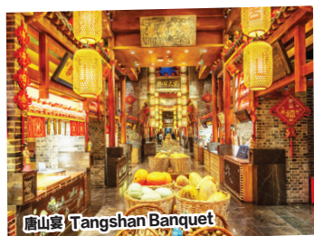
唐山宴 Tangshan Banquet