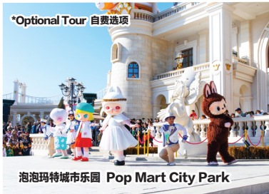
泡泡玛特城市乐园 Pop Mart City Park