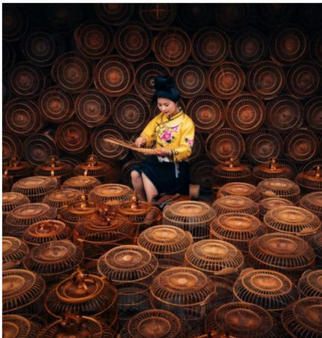
▲ 丹寨卡拉村 Danzhai Kalavillage