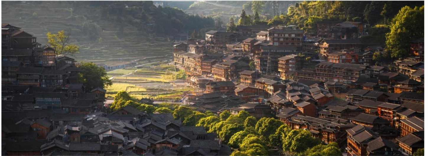
▲ 西江千户苗寨 Xijiang Thousand-House Miao Village