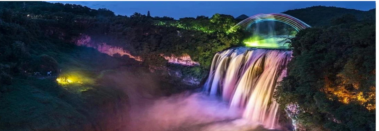
▲ 黄果树大瀑布 Huangguoshu Waterfall