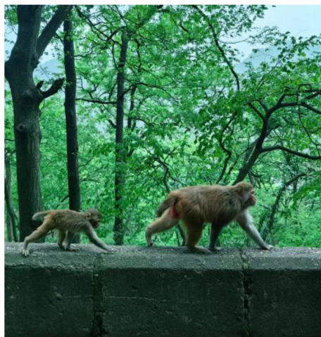
▲ 黔灵山公园 Qianling Mountain Park