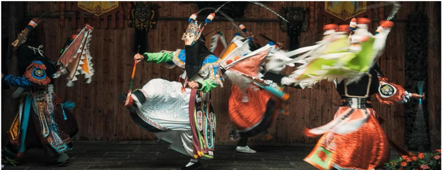
▲ 天龙屯堡 Tianlong Tunpu