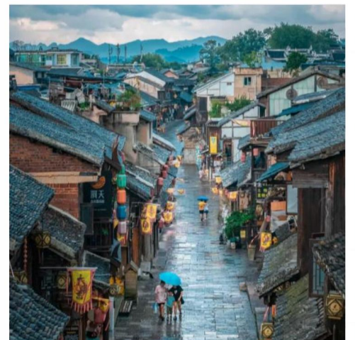
▲ 青岩古镇 Qingyan Ancient Town