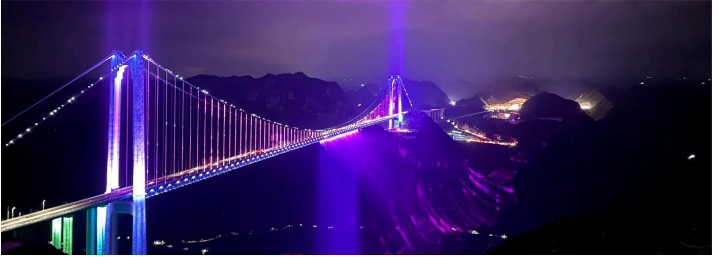
▲ 花江峡谷大桥 Huajiang Gorge Bridge