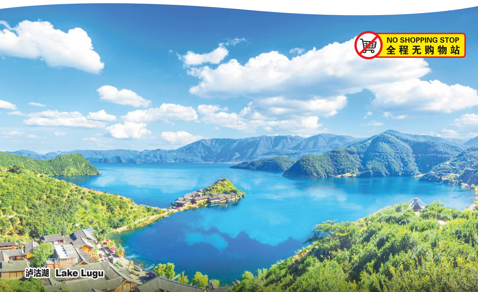
泸沽湖 Lake Lugu